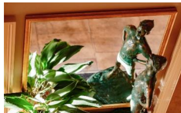
Peter Pan Moat Brae House