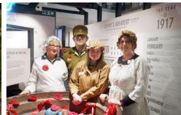
The Devil's Porridge Museum