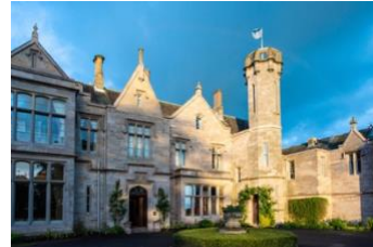
SCHLOSS Roxburghe Hotel & Golf Course

Situated north of the dividing line with England and covering a swathe of the Southern Uplands that runs down to a wild and picturesque coastline facing the North Sea, Midlothian and the Borders provide visitors with a bolt hole like no other place in the UK. With an added touch of luxury and an abundance of hidden gems, it's the perfect destination for your next trip.