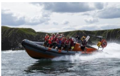
Eyemouth Rib Trips