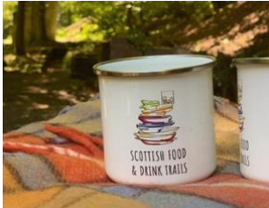
Scottish Food & Drink Trails