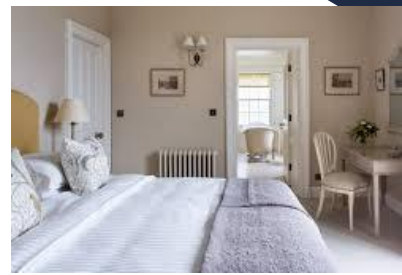
Hope Scott Wing at Abbotsford

There is a wealth of choice when it comes to accommodation, including unique and luxurious overnight options. Which one would you choose?