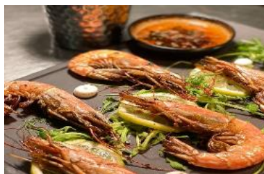
Oblò Bar & Bistro