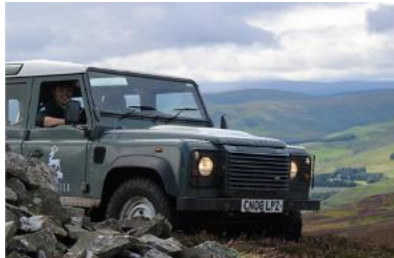
Bowhill Ranger Experience