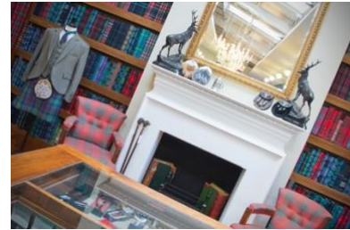
Lochcarron of Scotland

It's time to explore inland! And there are lots of exciting options available today. Start your day driving along winding country roads as you head towards Selkirk. The Scottish Borders have a strong textile tradition, with many mills and producers offering the opportunity to look behind the scenes of fine cloth, cashmere and tartan production. Take a private tour at Lochcarron of Scotland where you can even create your own family tartan.