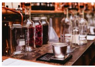
1811 Gin Masterclass