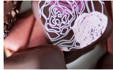
Cocoa Black Chocolate Boutique