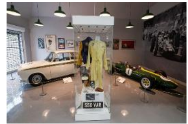
Jim Clark Motorsport Museum

Your trip begins in the Eastern Scottish Borders, exploring along dramatic coast lines and sandy beaches. St Abbs and Eyemouth offer a range of sights and activities with grand views over rugged cliffs in the nature reserve as well as dolphin spotting opportunities. Eyemouth Rib Trips can be booked exclusively for your party and offers an exhilarating experience with stunning views for up to 12 guests.