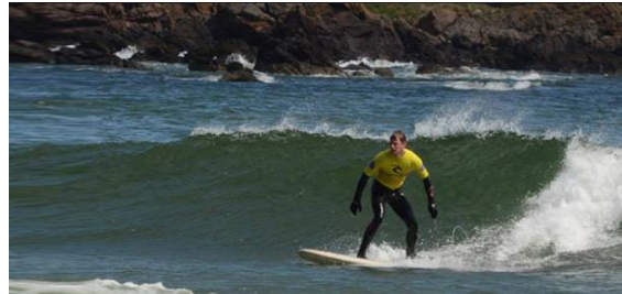
St Vedas Surf School