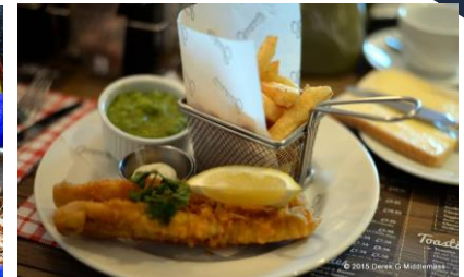
Giacopazzi's Award Winning Fish & Chips

It is an active fishing harbour – and a fresh catch always means fantastic fish and chips. You can also pick up the freshest fish and seafood to take home. Why not pop into Giacopazzis for award winning fish & chips, it is also home to the most delicious ice-cream. Upstairs from the ‘Chippie’ you find their restaurant called Oblo , serving the freshest of seafood platters.