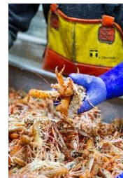
Prawn Fishing Eyemouth