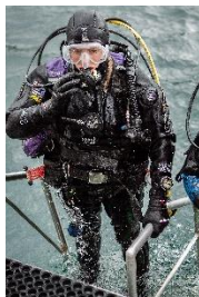
Dive St Abbs