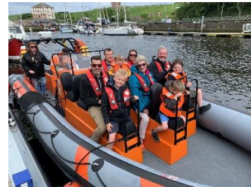
Eyemouth Rib Trips

The Berwickshire Coast is the one area where Scotland truly starts. Only 1 hour from Edinburgh, 10 minutes from Berwick-Upon-Tweed and 80 minutes from Newcastle, this is the ideal location for a day away from it all.