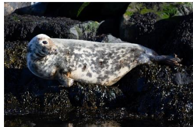
St Abbs National Nature Reserve