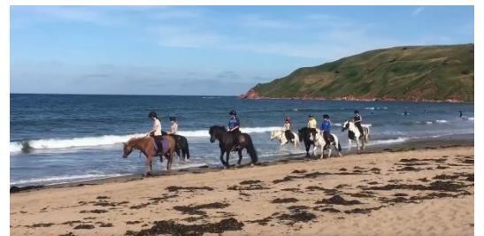
Eat Sleep Ride