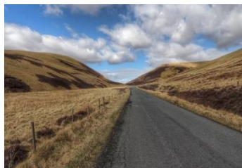
The Granites B709