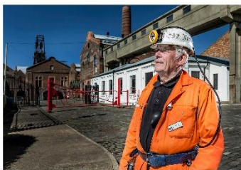
National Mining Museum