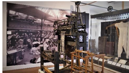
Borders Textile Towerhouse