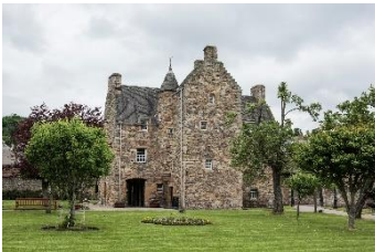
Mary Queen of Scots House