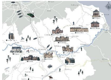
Big House Group Map