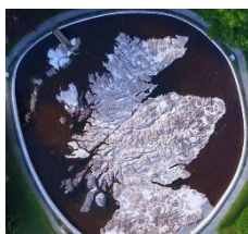
The Great Polish Map of Scotland