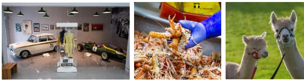
Jim Clark Motorsport Museum