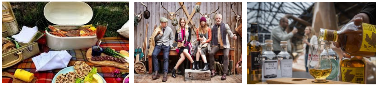
Scottish Food & Drink Trails