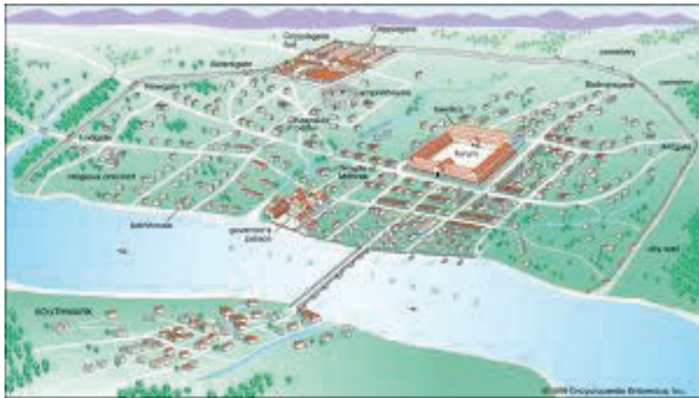
Londinium circa 200 AD

According to Wikipedia , infallible source of all wisdom, the city was founded in 43 AD and first referred to as "Londinium" a little less than a century later. Did London exist prior to 43 AD? Well, physically, yes, of course it did. The Thames was flowing, but it wasn't called the Thames. All the dirt was presumably there, too, but it wasn't called London, because there was no one there to call it London. So it really wasn't quite London yet, despite its geographical relationship to the town and then city that would later occupy that spot of ground.