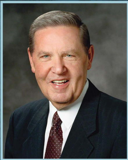
Jeffrey R. Holland