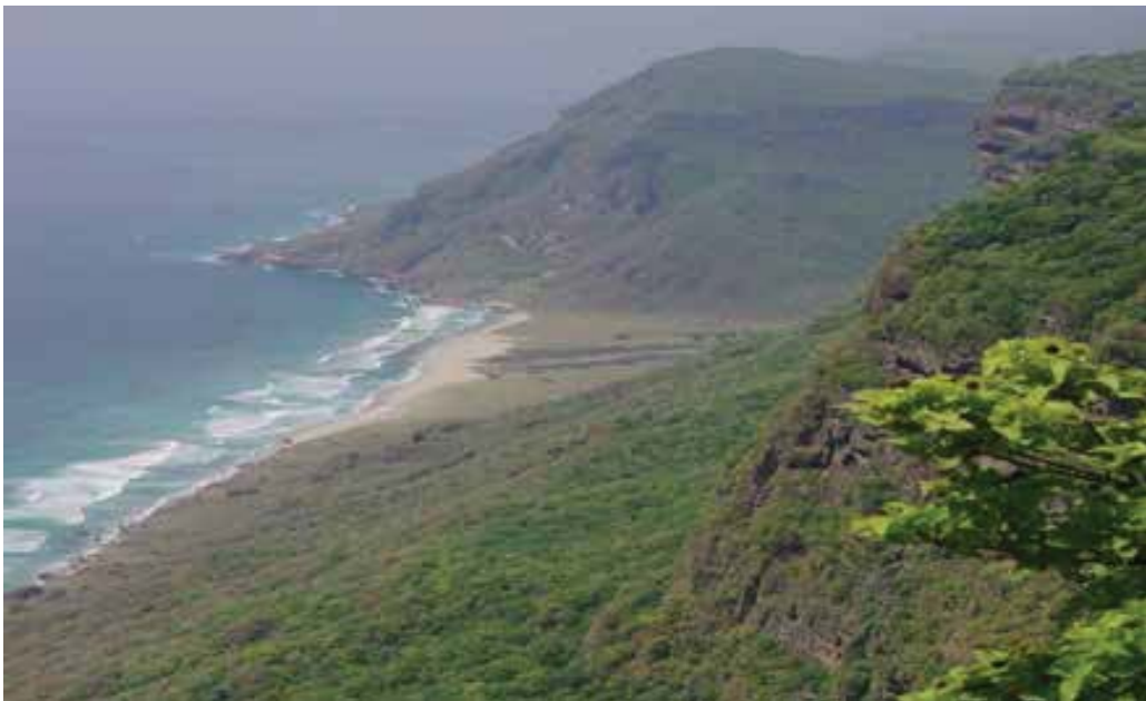
A view of Khor Kharfot, the mouth of Wadi Sayq, a leading candidate for Bountiful, with Arabia's largest freshwater lagoon and abundant fruit, nearly due east of Nahom.