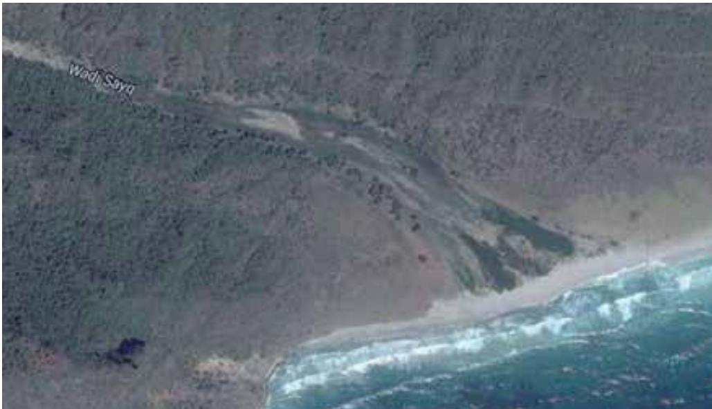
Satellite view of Wadi Sayq at Khor Kharfot, showing the large freshwater lagoon at the leading candidate for Bountiful, nearly due east from Nahom. Note: this Google Earth image was taken in the dryer winter months and thus lacks the vibrant green that follows the monsoon season.