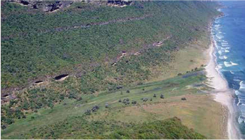
A view of Khor Kharfot at Wadi Sayq, facing eastward. Photo taken after the monsoon season when the area is especially green.

In contrast to Joseph's vague summary of Lehi's journey mentioned above, the Book of Mormon text provides a number of specific details: three days through the wilderness past the borders "nearer" the Red Sea to the Valley of Lemuel, which has a continuously flowing river, and