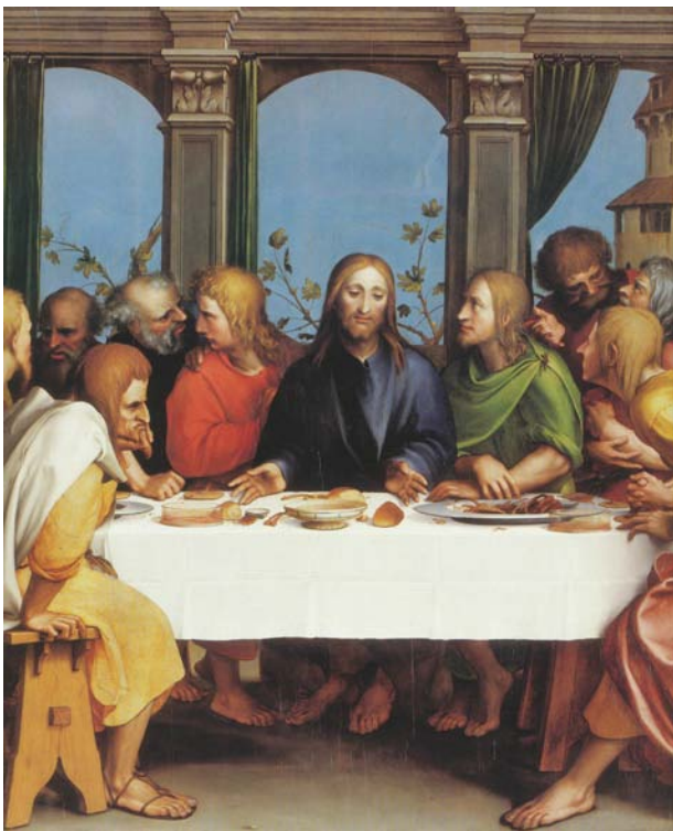
The Last Supper by Hans Holbein, 1525.

1 John 2:3 “We know that we have come to know him if we keep his commands” (NIV) At His Last Supper, the Savior taught to know God is to have Eternal Life (John 17:3). This type of knowledge will result from obedience to His commandments and having a pure heart and desires. Knowing God can only happen in obedience to His truths and light. In Semitic thought, “knowledge implies intimacy.” 15 That closeness with God comes from closely following His commandments so that we can become like Him.