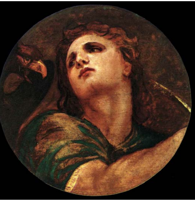
St. John the Evangelist by Titian, first half of 16th century.

“her children.” Tradition holds that John wrote to an unnamed church congregation in or near Ephesus.