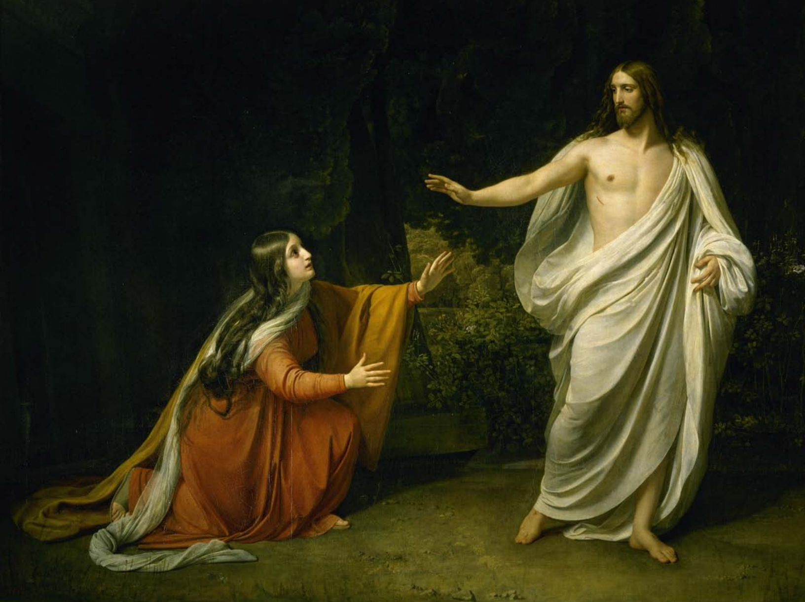
Christ's Appearance to Mary Magdalene after the Resurrection by Alexander Andreyevich Ivanov, 1835.