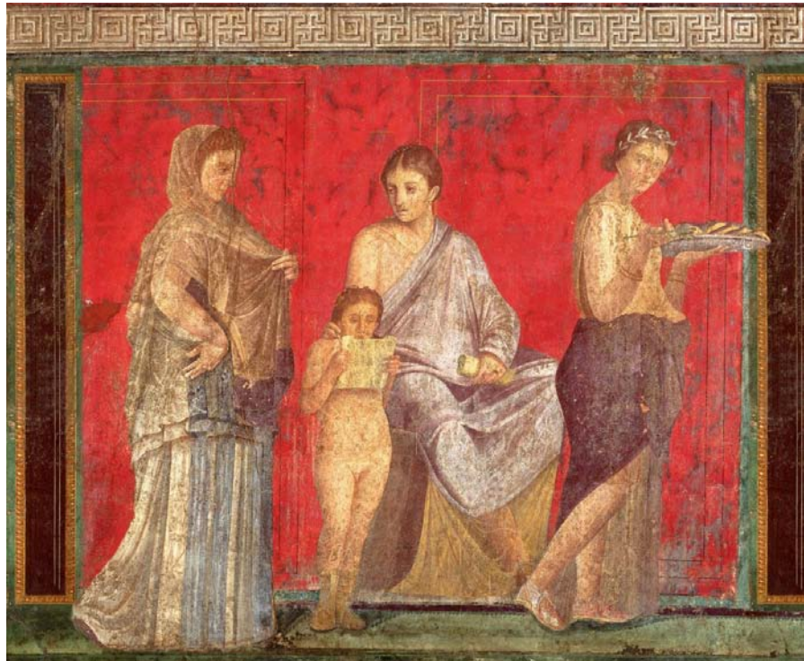
The first mural fresco in the Villa of the Mysteries in Pompeii. It is thought these frescoes depict the initiation of a young woman into a Greco-Roman mystery religion. This fresco depicts the reading of the rituals.

Paul harkens back to 1 Corinthians 1:12 (“I follow Paul . . . Apollos . . . Cephas” ESV) and says not to feel so proud of one leader that it comes at the expense of another. He asks the Corinthians not to feel “ puffed up ” or “inflated” with an attitude of “pride” rather than charity, cooperation, mutual respect, and forgiveness.