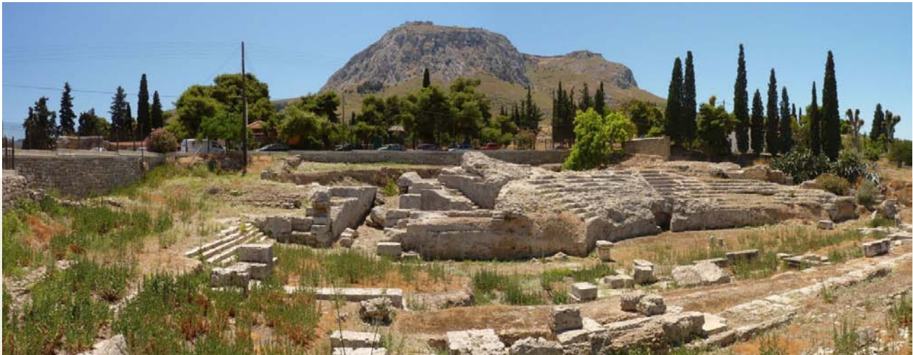
Ancient Corinth

Paul kept in touch with the saints in Corinth after his departure (1 Corinthians 1:11; 5:9; 7:1; 16:10–11, 17). He wrote 1 Corinthians a few years later on his next mission (probably in Ephesus during the spring of AD 57, 1 Corinthians 16:8). 2 It appears that he wrote to Corinth more than any other place—as there are traces of seven letters. What we refer to as “First Corinthians” was not the first.