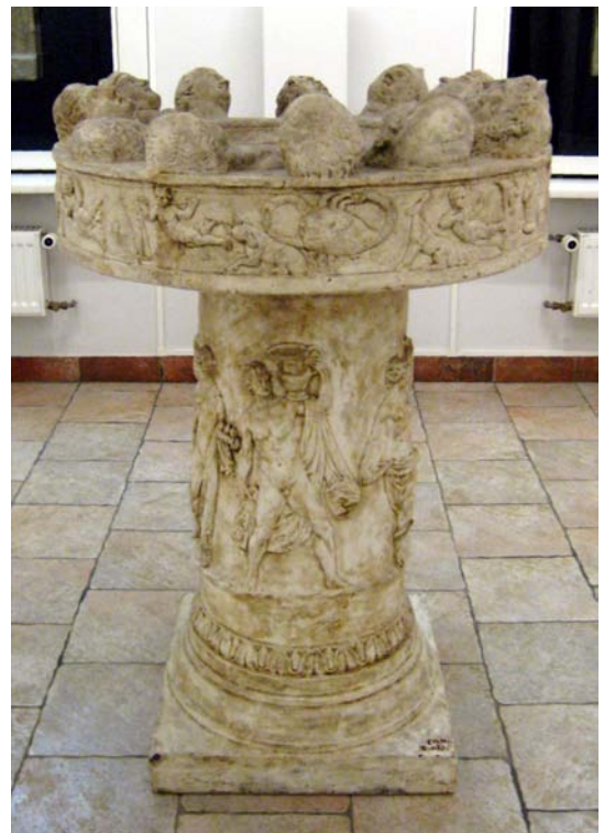
Altar that represents twelve gods of the Roman pantheon, 1st century CE.