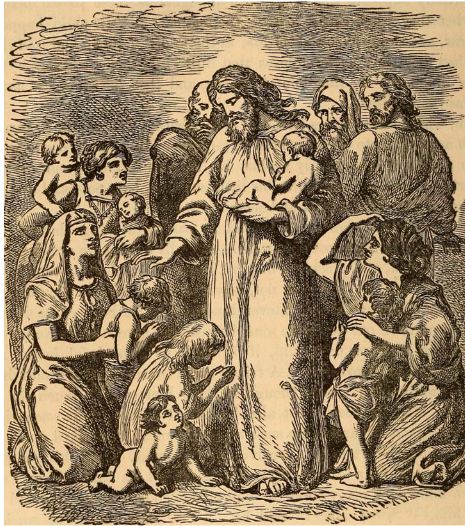
Jesus Christ exemplifies the kindness and compassion of which Paul teaches. Image from The pictorial Bible and commentator: presenting the great truths of God’s word in the most simple, pleasing, affectionate, and instructive manner, 1878.

1 Corinthians 13:5 “Doth not behave itself unseemly, seeketh not her own, is not easily provoked, thinketh no evil” A charitable person behaves properly, not rude, crude, and “unseemly.” To develop charity, one “is not self-seeking” (BSB) or “does not insist on its own way” (ESV) and looks outside one’s self to the needs and interests of others. If the saints have developed patience, as listed in verse 4, then they are “not irritable or resentful” (ESV), nor prone to anger or take offense. They take responsibility for their emotions without blaming another. The final phrase in this verse has many meanings. “Thinketh no evil” can apply to deliberately conjuring up problems against others, or inferring falsehoods, and gathering defamatory resentful data to stir up contention. This also includes when one figuratively steps onto another to build up oneself. This includes pornography, and other self-satisfying habits that demean others. In this way, Paul’s phrase sounds similar to Zechariah 8:17, “Let none of you devise evil in your hearts against his neighbor” (ASB). Love includes being trustworthy—emotionally.