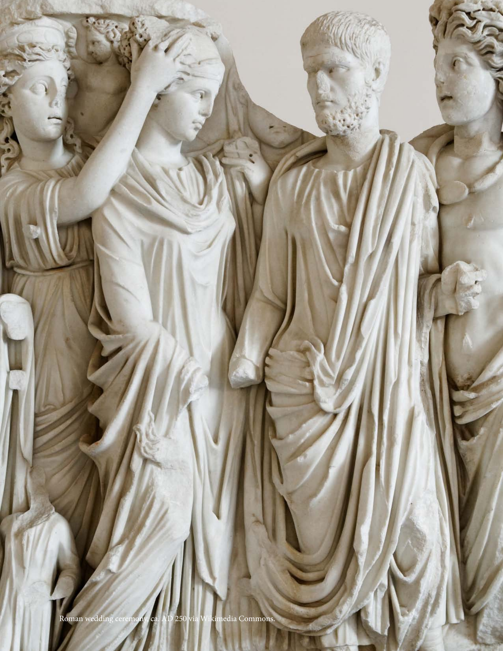
Roman wedding ceremony, ca. AD 250 via Wikimedia Commons.