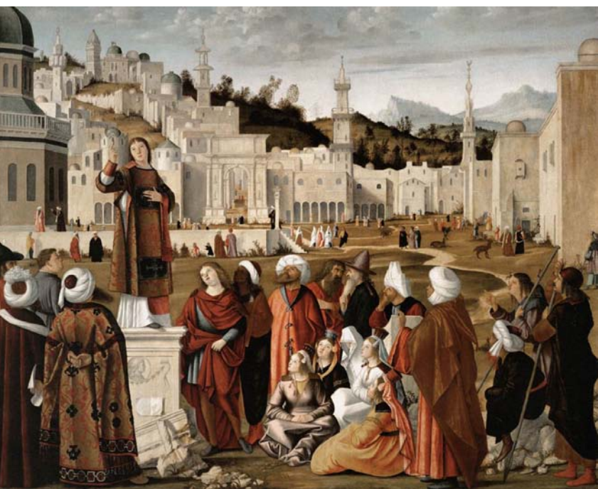
The Sermon of St. Stephen by Vittore Carpaccio, 1514.

Acts 7:23-26 “when he was full forty years old it came into his heart to visit his brethren” The first time Moses tried to redeem the Israelites from slavery, they did not understand, and they rejected him. The number forty may be literal here, but it is also used in the Old Testament for a “purification period” (Leviticus 12:3-4; Genesis 7:17; Exodus 24:18; etc.). Stephen used “forty years” four times in recapping Moses’ history (Acts 7:23, 30, 36, 42).