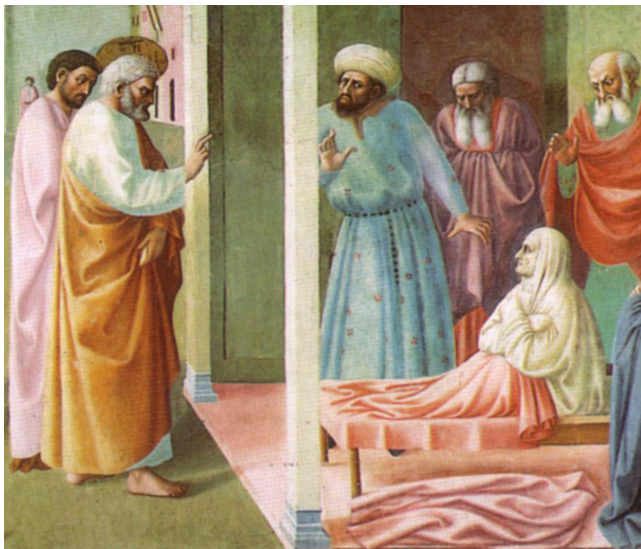
Healing of the Cripple and Raising of Tabitha by Masolino da Panicale.

Acts 9:36 “There was at Joppa a certain disciple named Tabitha” Eleven miles west of Lydda, along the same road from Jerusalem to the Mediterranean Sea coast, Joppa was a big city in its day. Luke highlights a virtuous woman from Joppa, who holds the distinction of being the only named woman in the New Testament referred to by the feminine form of the Greek word “disciple / mathetria .” (However, the Greek suggests there were others. 26 ) Tabitha (in Aramaic) or Dorcas (in Greek) is one of the forty-five named women in the New Testament (at least thirty of whom are described as devoted saints). 28 As a disciple, she broke the pharisaic restrictions against female learning, and became a pupil of Jesus’ gospel. She was a public figure among the Christian community in Joppa for her contributions of time and service to the needy: “always occupied with works of kindness and charity,” which included weaving and sewing clothing (BSB).