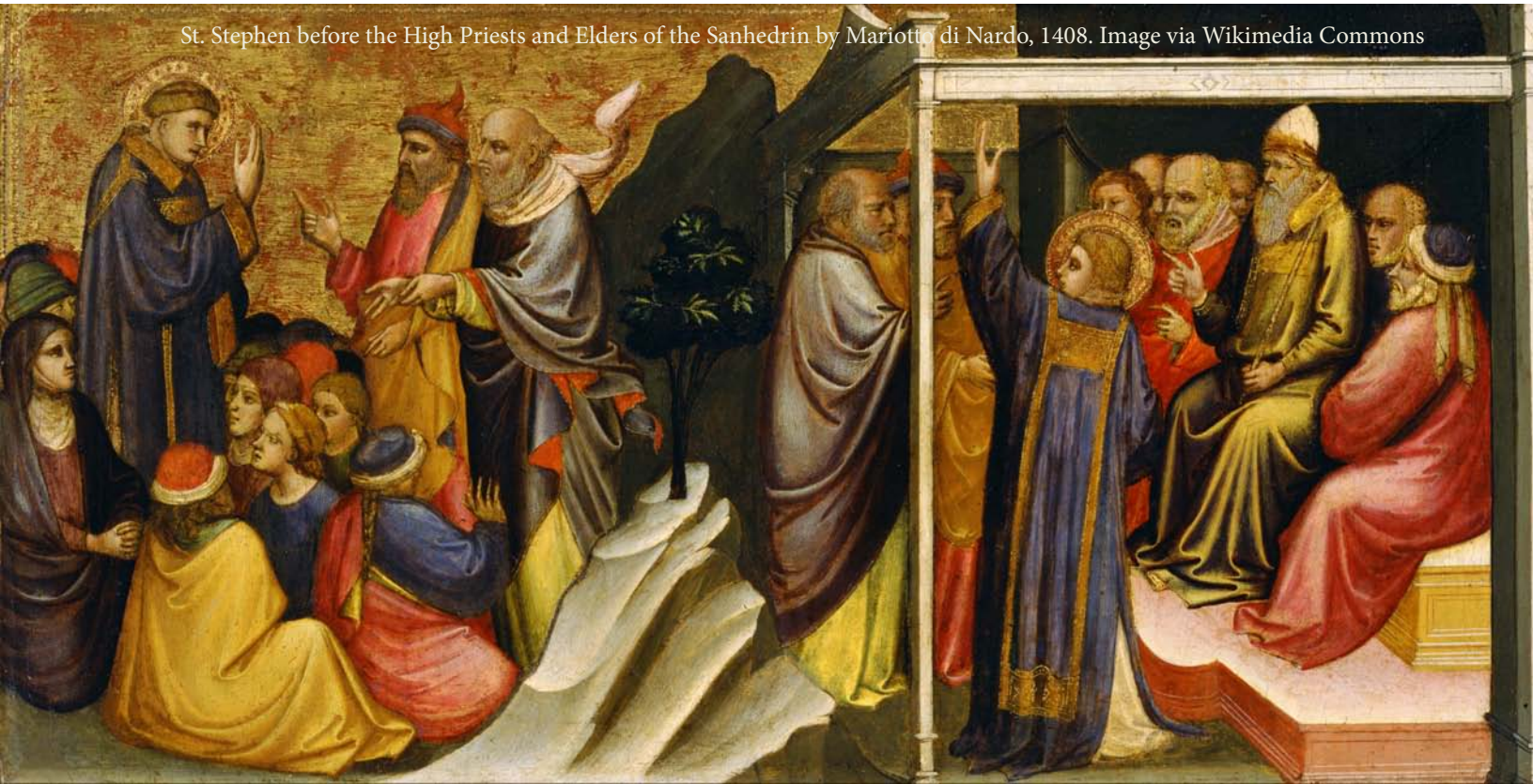
St. Stephen before the High Priests and Elders of the Sanhedrin by Mariotto di Nardo, 1408.

Acts 7:6–8 “God spake on this wise, That his seed should sojourn in a strange land . . .” Stephen recounted God’s prophecies showing His omniscience and emphasizing “the covenant of circumcision” that Abraham passed down through the patriarchs, Abraham to Isaac to Jacob. By speaking of God’s covenant to Abraham, Stephen showed respect for the Jewish customs. He reviewed the biblical history of salvation as a witness that he had not blasphemed the law. These examples of God’s dealings with the covenant people are significant to Christian history as well.