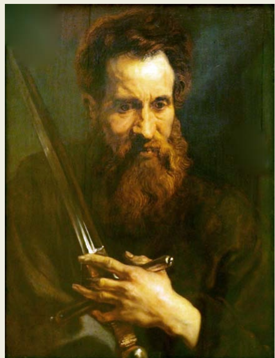
The Apostle Paul by Anthonis van Dyck.

Later in the text, Luke includes that Saul was a Roman Citizen, and a student of the great rabbi and Sanhedrin member, Gamaliel of Jerusalem (Acts 22:3, 25). As a member of the Sanhedrin, Gamaliel would have been aware of Jesus' and Peter's preaching. Paradoxically, Paul's writings do not include that he heard anything about Jesus during His ministry. He grew up in Tarsus, as a “Hebrew of Hebrews; as touching the law, a Pharisee.” We assume that his family would have joined annual pilgrimages to Jerusalem (Philippians 3:5). Paul gives more autobiographical tidbits in his Epistles, which we will explore later.