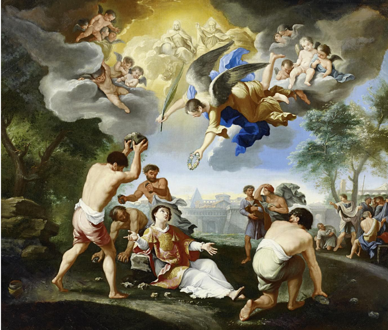
The Stoning of St. Stephen by Luigi Garzi, 17th century.