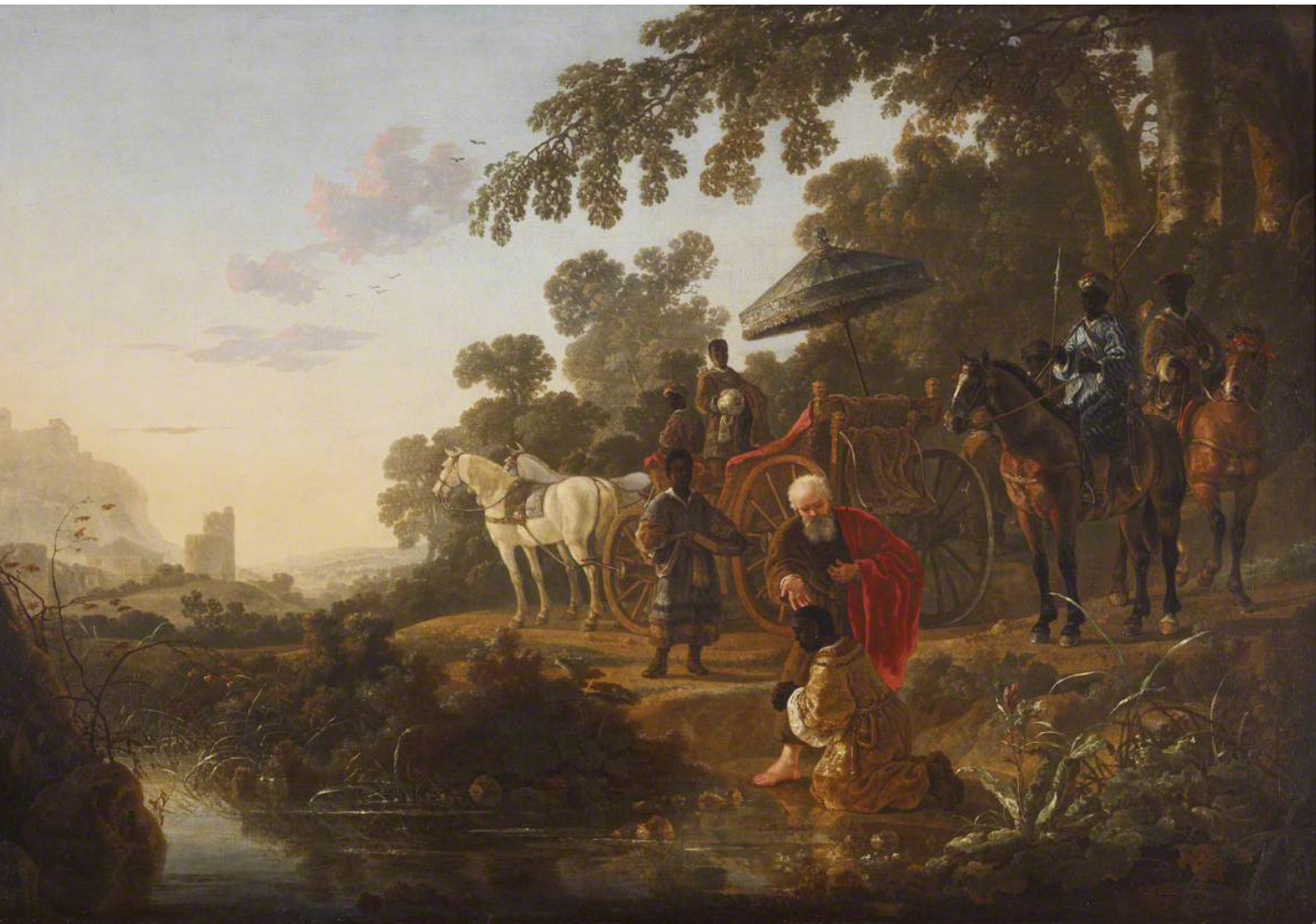
Saint Philip Baptising the Ethiopian Eunuch by Aelbert Cuyp, ca. 1655.

Acts 8:29 “The Spirit told Philip, ‘Go and join that chariot” (CSB) The Spirit took over the angel’s role of guiding Philip’s missionary efforts to this specific man. The Spirit continues this individual ministry as each person in each generation is cherished by God.