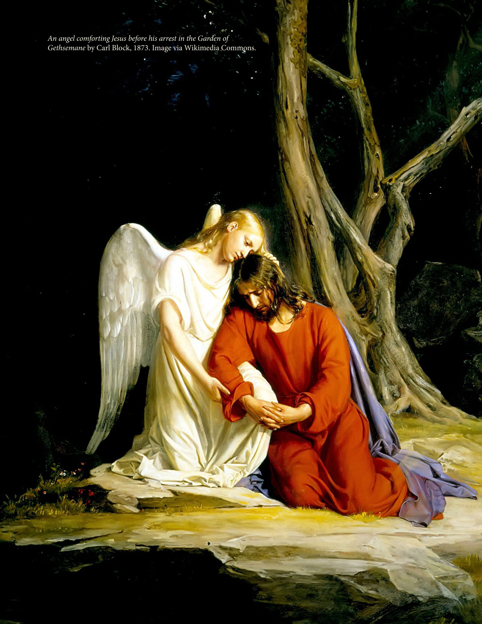
An angel comforting Jesus before his arrest in the Garden of Gethsemane by Carl Block, 1873.