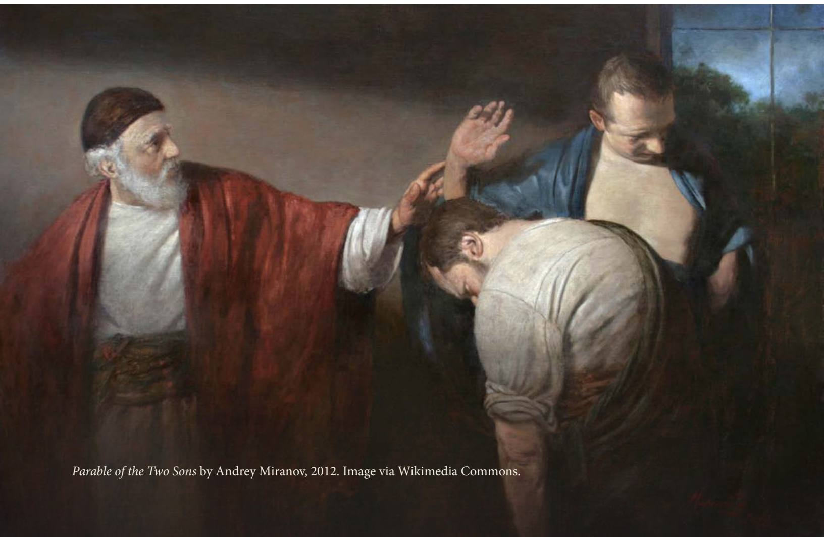
Parable of the Two Sons by Andrey Miranov, 2012.

They are specifically asking who gave Him authority to cleanse the temple, possibly perform healings, and teach new doctrines. Authoritative teaching was firmly established among the Jews. All teaching was traditional, so it