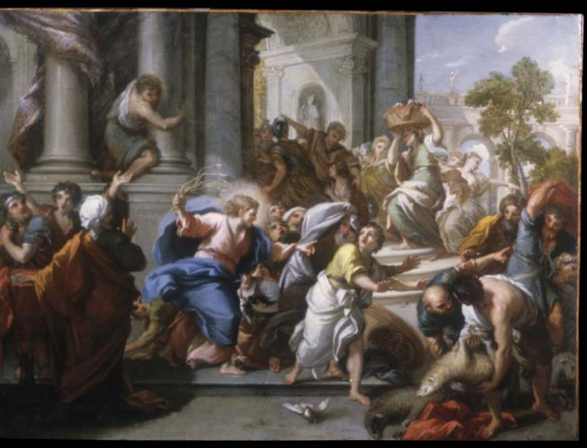
The Cleansing of the Temple by Giuseppe Passeri.

The Temple Courtyard of the Gentiles made up the majority of the 35 acres of the Temple Mount where all were allowed to visit (similar to Salt Lake City’s Temple Square). Israelite celebrants could purchase animals necessary for their sacrifices and change their money for the temple coin, which was a Tyrian half-shekel. All financial transactions in the temple had to be in the “Tyrian” currency—including the annual temple tax, sin offerings, vows, purification, etc.