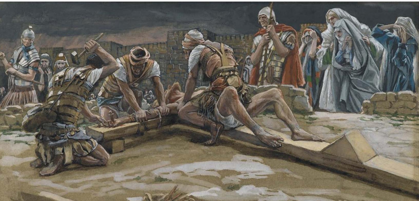
The First Nail by James Tissot.

lashes” (Deuteronomy 25:3). The Romans used leather cords of different lengths with bones, rocks, and metal tied along the leather to cut into the skin and muscle. The victim was tied to a pole, then one or two soldiers whipped the bare back, buttocks and legs of their victim. It was often used to discipline slaves. In fact, “the trademark of slaves, was a back scarred from whippings.” 24 Jesus took the role of a slave throughout his ministry: at the last supper while washing feet, and now He bore the sign of a slave on His back. 25