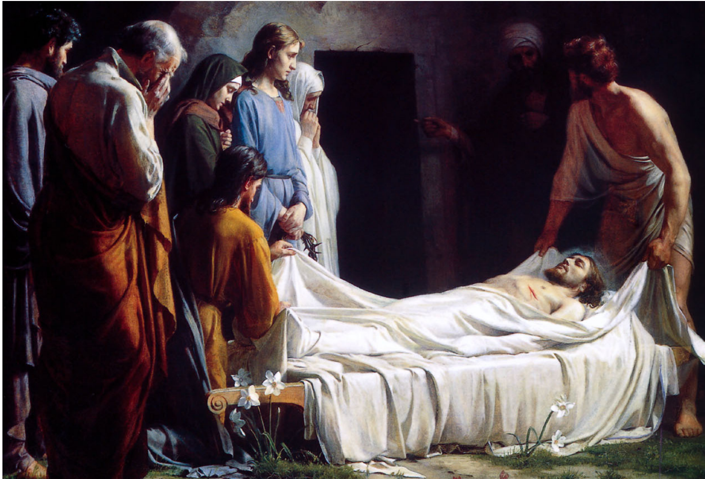
Burial of Christ by Charl Bloch.

President Joseph F. Smith reported his vision the next day in General Conference. Before the month was out, it was canonized as the next section of revelations collected in the Doctrine and Covenants (D&C 138).