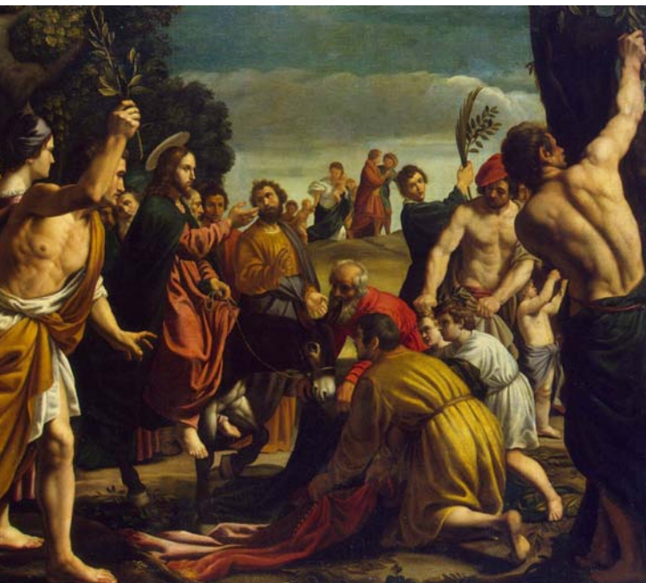
Entry Into Jerusalem by Pedro Orrente.