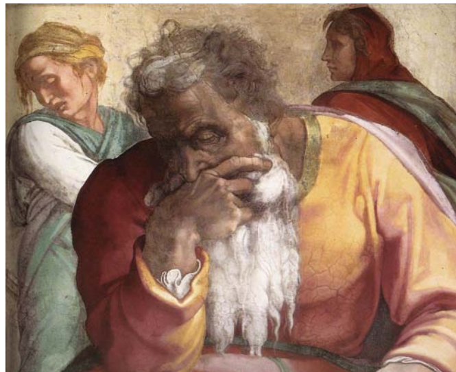
Jeremiah by Michelangelo, 1511.

In Paul’s “previous way of life” (NIV) he intentionally tried to destroy Christianity, thinking it was a devilish apostasy from Judaism (Acts 9:10–22). He excelled in academic Judaism because of his great zeal to live the Law of Moses (Acts 22:3 4 ). He also excelled in Greek, as his letters attest. He was uniquely qualified, being born in a capital Greek city, as a Roman citizen, into a zealous pharisaic family. Even more importantly, once the Lord intervened and corrected his understanding of the Gospel, he learned through personal revelation (Acts 22:6–10; etc.).