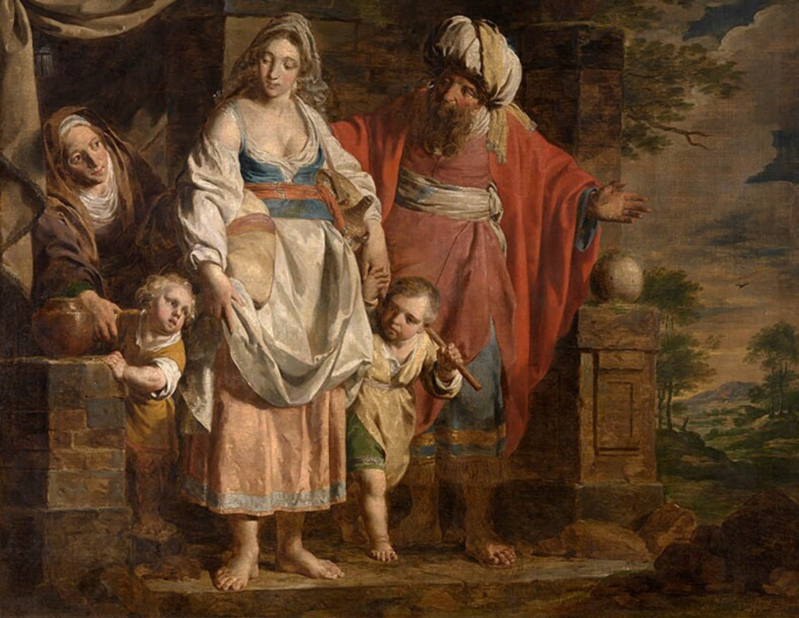
Hagar and Ishmael Banished by Abraham by Pieter Jozaf Verhaghen, 1781.

applied anywhere else. (We take a similar approach when we “apply the scriptures to ourselves.”) Paul talks about Abraham’s wives, Sarah (the “freewoman”) and Hagar (the “bondmaid”), and their two sons, Isaac and Ishmael respectively. He refers to the converts who want to return to the old Law of Moses as Hagar, and those accepting Jesus’ the new law as Sarah (Genesis 16–21). Sarah’s son Isaac became the heir, just as Christ can provide an eternal reward for all His posterity. Paul continues to expand on this analogy through the end of the chapter.