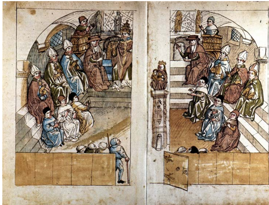
Illustration of the Council of Constance, ca. 1465.

Galatians 2:3 “Yet not even Titus, who was with me, was compelled to be circumcised, even though he was a Greek” (NIV) The leadership agreed together in the Jerusalem Council that Titus (as an example of all new Gentile converts) could be a full standing Christian without circumcision. Since the time of Abraham, circumcision was a required sign of the covenant—for those males who joined him by birth or proselytizing—to obey God (Genesis 17:11). It became common among ancient Semitic people, but was despised by the Greeks. 6