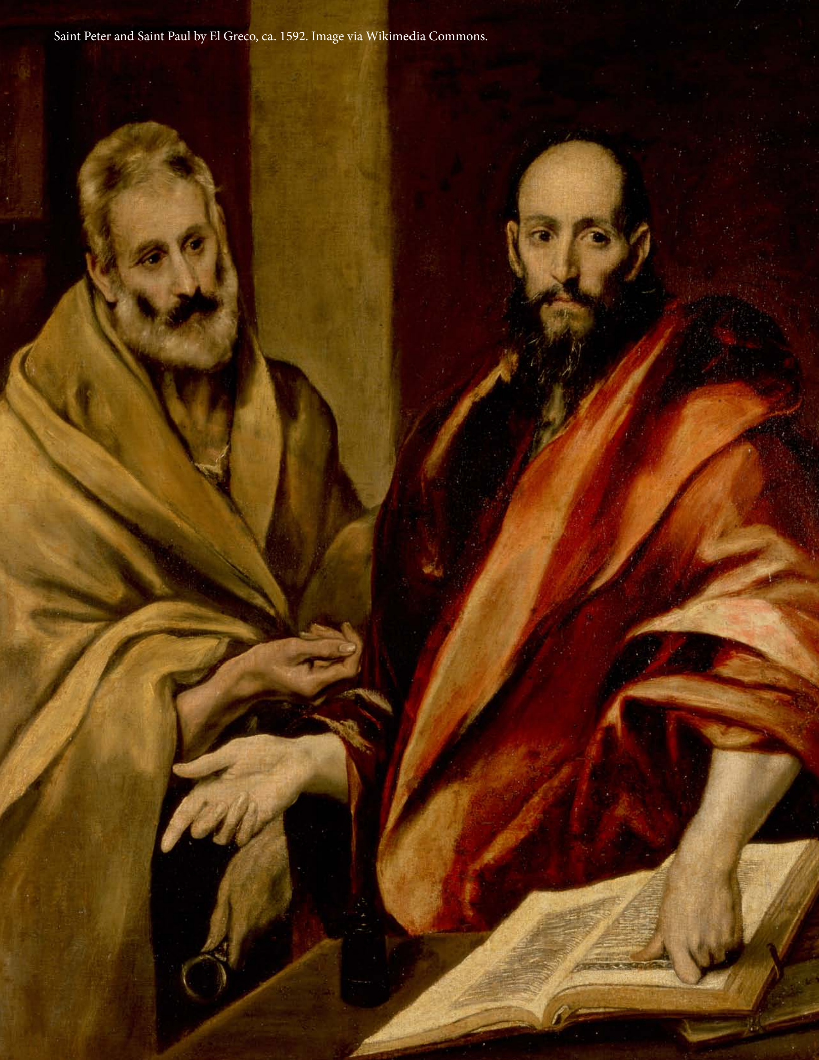
Saint Peter and Saint Paul by El Greco, ca. 1592.