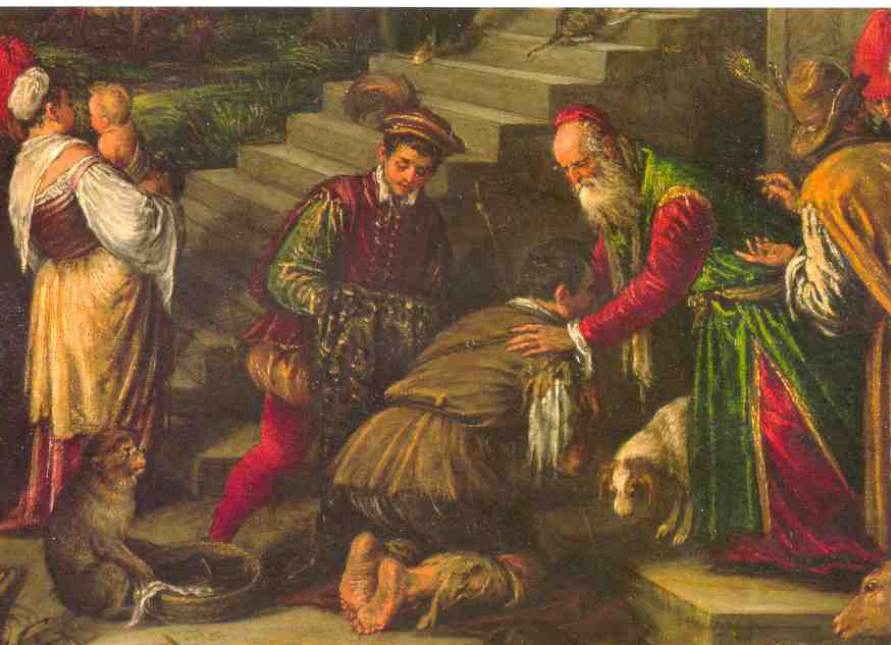
The Return of the Prodigal Son by Francesco Bassano the Younger, ca. 1580. Through repentance, we become heirs with Christ.

Galatians 4:4–5 “When the time had fully come, God sent His Son . . . to redeem those under the Law, that we might receive the divine adoption as sons” (BSB) The KJV translated the first phrase, “fullness of time” (KJV), to mean when Christ came to earth carrying over to his time. But this is not the way we use it in our dispensation. We refer to Jesus’ time as the “meridian to time” and the “fullness of time,” from our dispensation as we prepare for Jesus’ Great Second Coming. 23 Then comes the wonderful redemption through God’s Son.