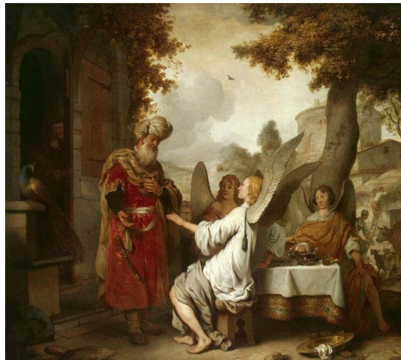
Abraham and the Three Angels by Gerbrand van den Eeckhout, 1656.

Galatians 3:21–23 “ Is the law, then, opposed to the promises of God? Certainly not! . . . The Scripture pronounces all things confined by sin . . . Before this faith came, we were held in custody under the law ” (BSB)