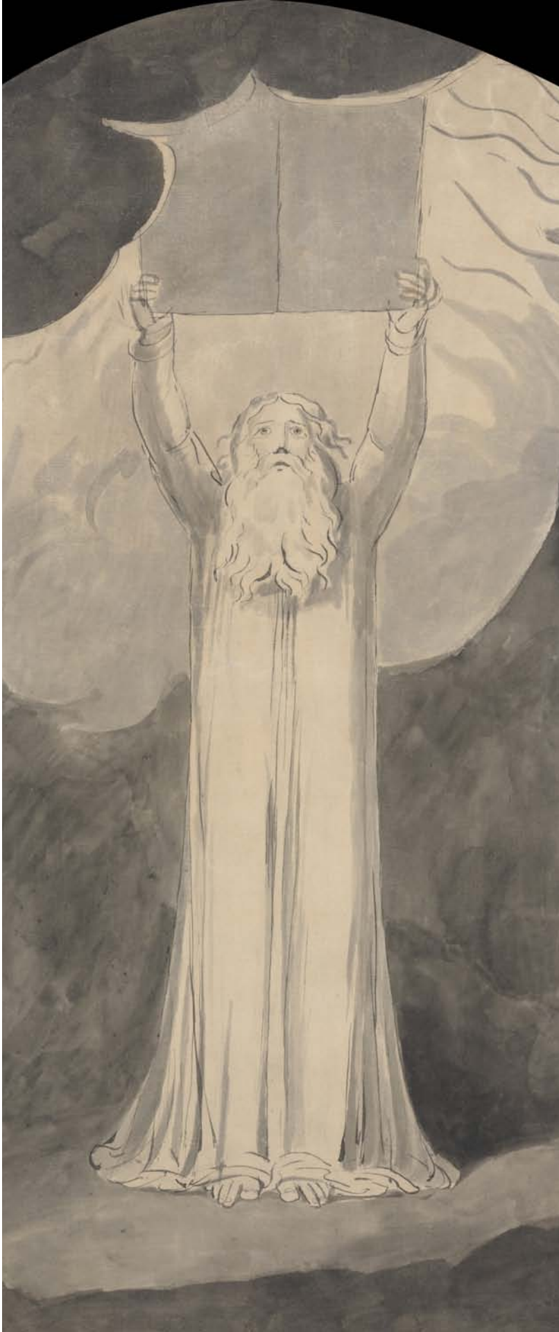
Moses Receiving the Law by William Blake, ca. 1780.

in whom I have trusted. My God hath been my support . . . why should I yield to sin, because of my flesh? Yea, why should I give way to temptations, that the evil one have place in my heart to destroy my peace and afflict my soul? Why am I angry because of mine enemy? Awake, my soul! No longer droop in sin. Rejoice, O my heart, and give place no more for the enemy of my soul (2 Nephi 4:17–21, 27–28).