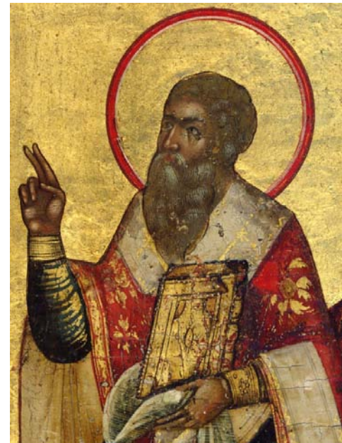
James the Just, Lord's brother. Artist Unknown, ca. 1809.

did not meet any other apostles except for James, the brother of our Lord, the second son of Mary (Jesus had four half-brothers and at least two sisters who are listed in Matthew 13:55; Mark 6:3). There are three different James in the New Testament. James was a popular name among the Jews because in Hebrew it is, “Jacob.” This James was not either of the Jameses mentioned as original members of Jesus’ Twelve apostles/disciples, 5 James the son of Zebedee and brother of John the Beloved—as he was martyred in ca. AD 44 (Acts 12:2), nor James the son of Alphaeus (Matthew 10:3). This James was probably the author of the Epistle of James. We also learn from this verse that James was an apostle too, but we do not know if he were ever a member of the Quorum of the Twelve (just as Paul is never included with them).