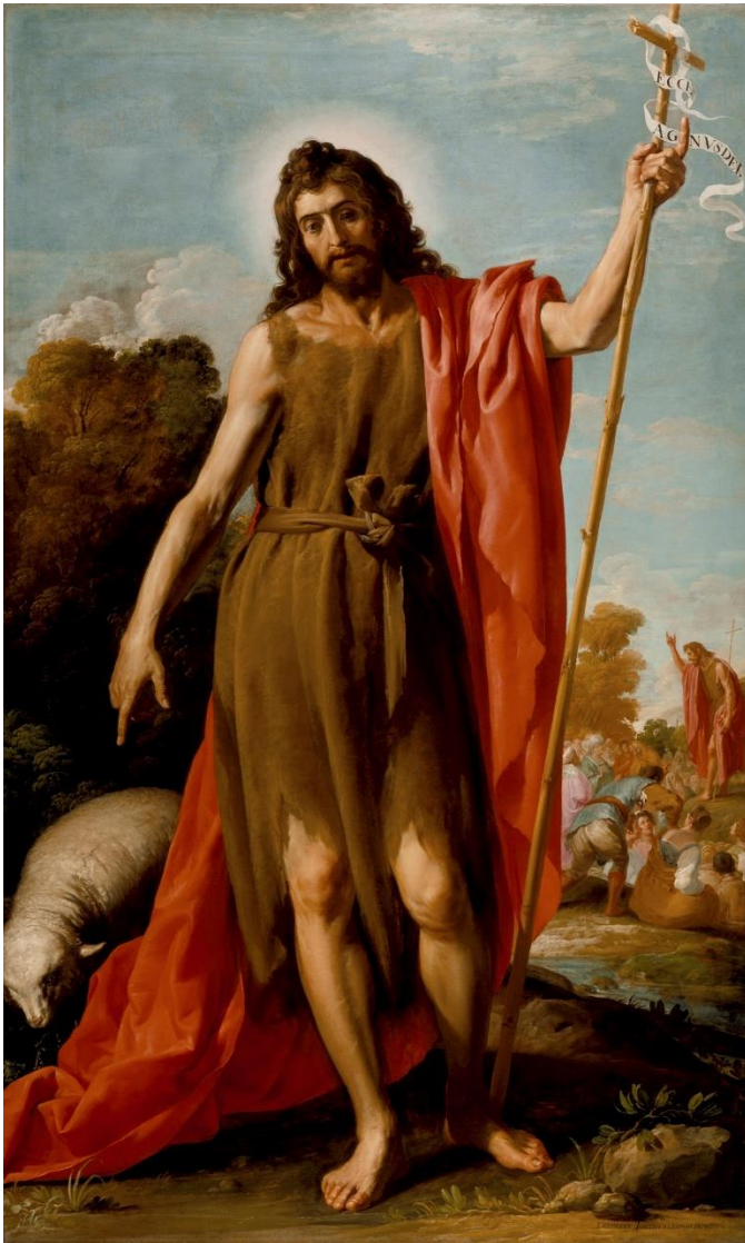
Saint John the Baptist in the Wilderness by Jose Leonardo.

John 3:22–24 “ baptizing ”: Only the Gospel of John says that Jesus and disciples baptized in southern Israel simultaneous to John the Baptist’s mission (which disagrees with the Luke 3:19–20 timing of John the Baptist’s imprisonment after Jesus’ baptism).