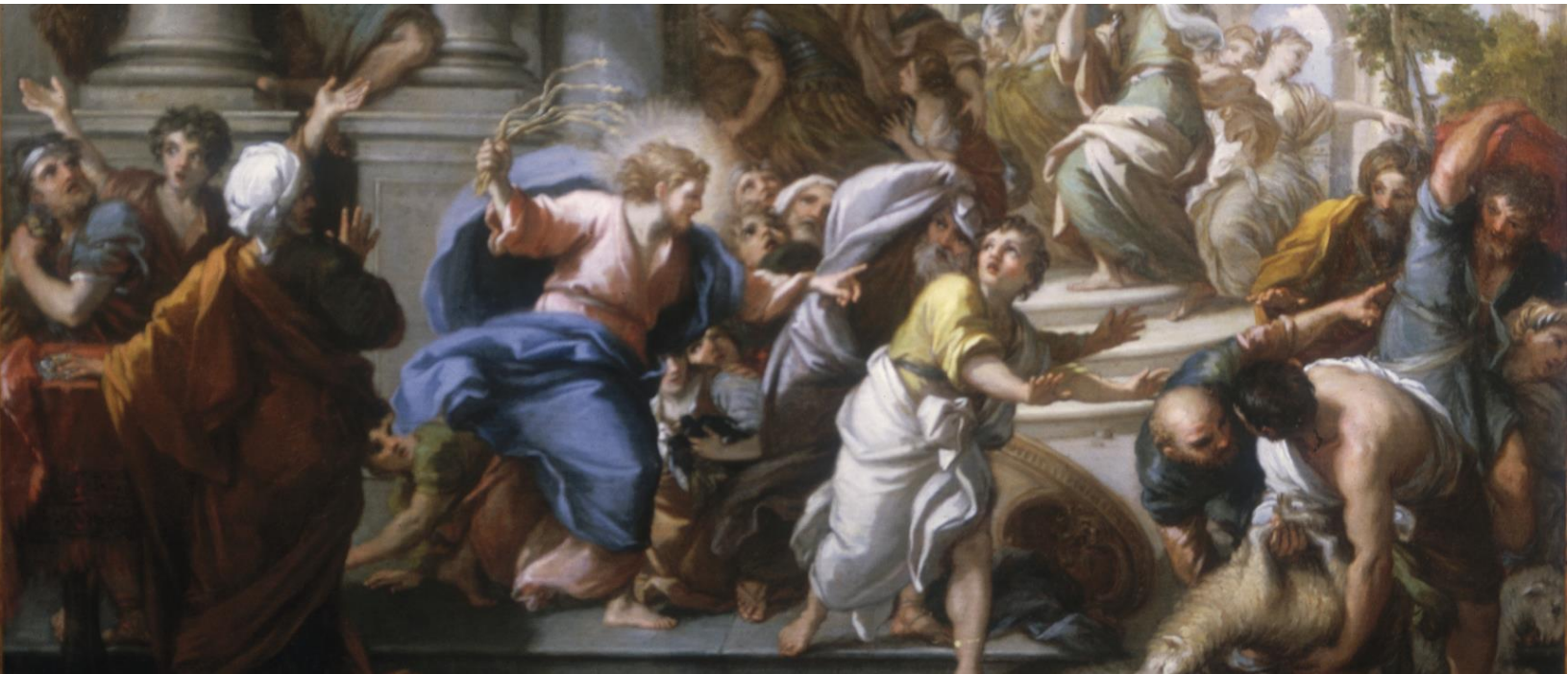
The Cleansing of the Temple by Giuseppe Passeri.

John 2:18 “ sign ”: Interestingly, the Jewish pilgrims did not condemn what Jesus had done, they only questioned if this was the sign of the Messiah. Even the apocryphal book of Tobit prophesies of the future cleansing. 12