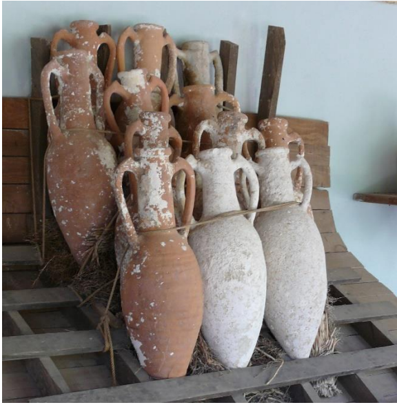
Image of ancient ceramic amphorae.

John 2:7 “to the brim”: This foreshadows Jesus’ blood which is completely available to all. I love the image of filling our vessels, or lives, completely with the Lord’s directions, and likewise, His atonement. To make His future blood/wine to purify all, His atoning sacrifice also required taking Him to the brim of His Divine capacity (Luke 22:42).