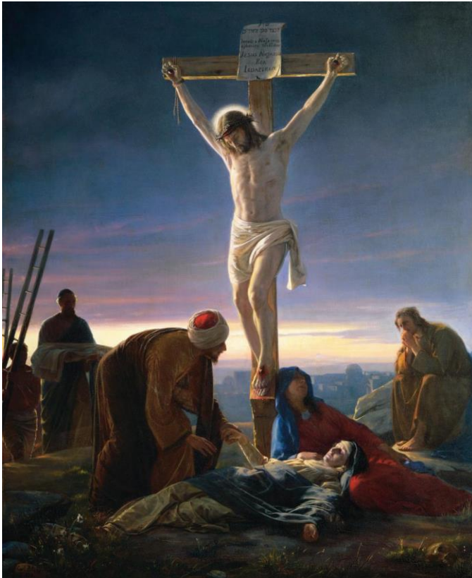
Christ on the Cross by Carl Heinrich Bloch.

John 3:13 “came down”: From now on, Nicodemus wasn’t involved in Jesus’ monologue. Jesus also revealed the nature of the Father by introducing himself as “Son of Man.” The Father is “Man of Holiness,” the supreme exalted Man (Moses 6:57)