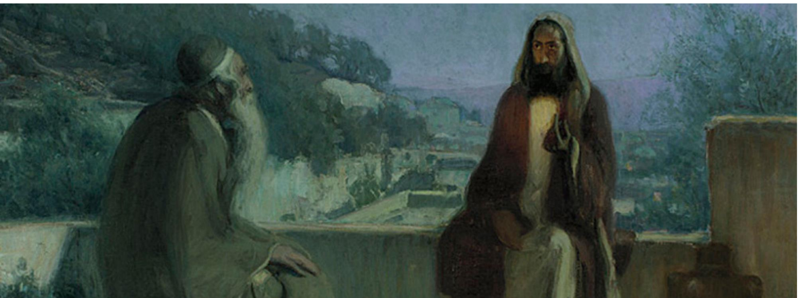
Christ and Nicodemus by Henry Ossawa Tanner.

John 2:24–25 “ He knew ”: The “sign” of cleansing the temple is marveled at, but not understood yet. John describes Jesus in control as the omniscient creator (JST: “He knew all things ”), even if His people do not recognize Him.