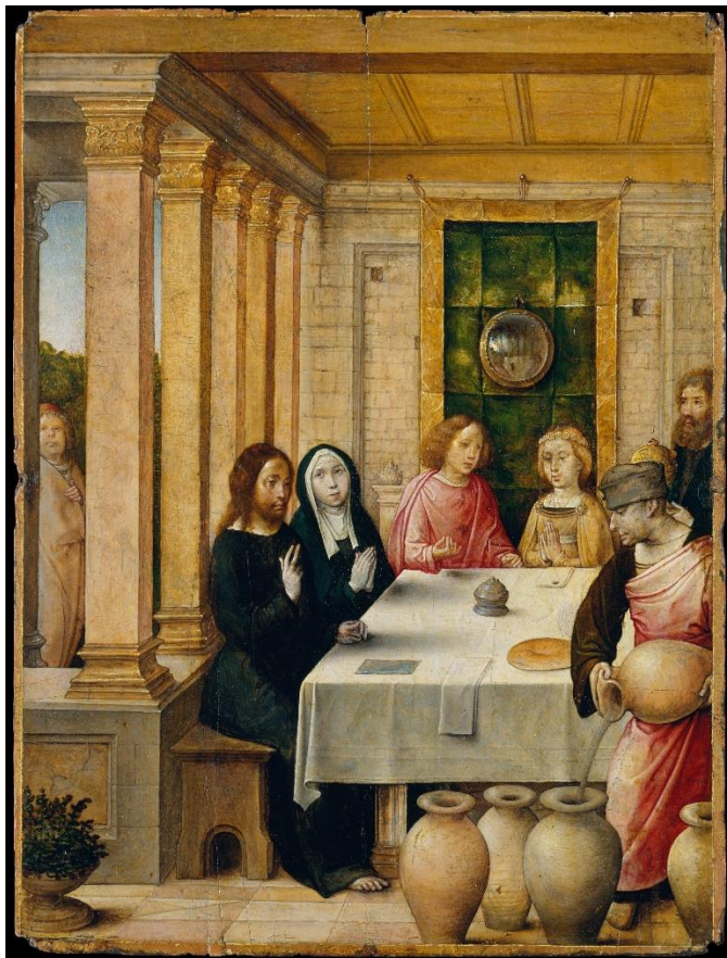
The Marriage Feast at Cana by Juan de Flandes.

John carefully highlights Jesus’ first “miracle” (KJV) or “sign” (most modern translations) to symbolically teach a higher meaning of purification, and foreshadow the cleansing power of His blood. The first miracle also parallels the first miracle performed by Moses at Pharaoh’s court—turning the water to blood (Exodus 4:9; 7:17–21).