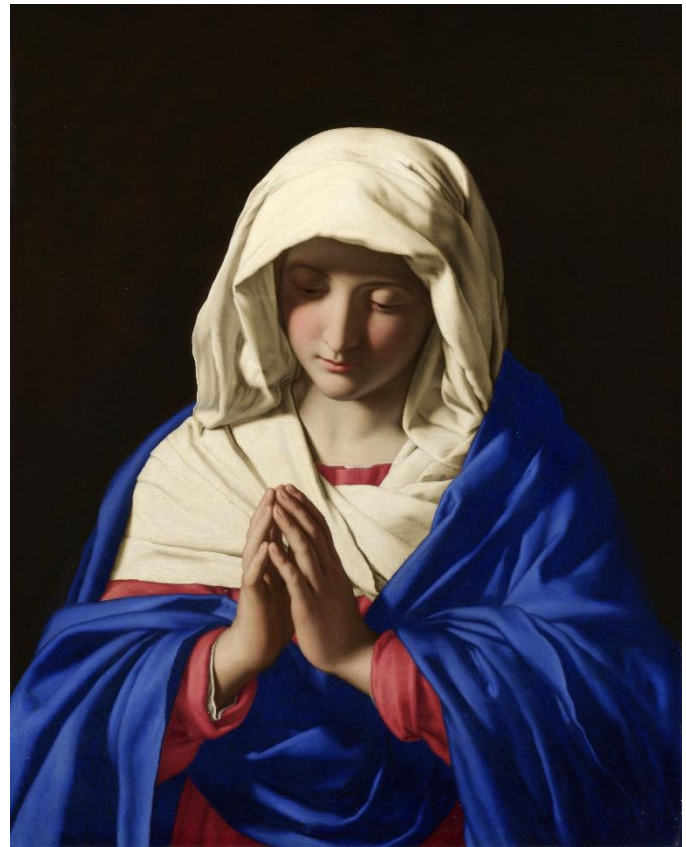
The Virgin in Prayer by Giovanni Battista Salvi da Sassoferrato.

John 2:3 “they have no wine”: In the ancient world, extending proper hospitality to guests was a serious obligation. Running short of wine could even end in a lawsuit. 6 A wise hostess held back food and drink for later. As Mary was worried about the wine, she was probably a close relative or friend of someone in the wedding party. Mary’s comment, “they have no wine” was used by John, as a leading tone, to symbolically highlight the bareness of Judaism.