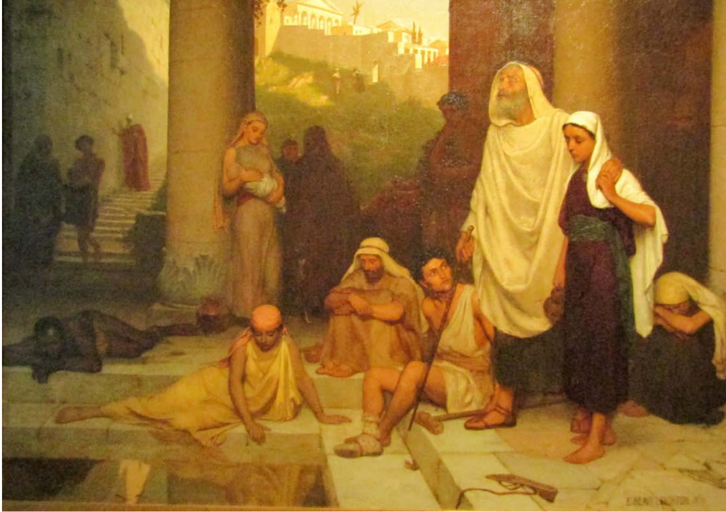
The Blind Man at the Pool of Siloam by Edmund Blair Leighton. Oil on canvas, 1879.

place, and is about to demonstrate something that will draw even more attention to him. He also is about to provide evidence for everything he just talked about: He is the Light of the world, he is the righteous judge, he is the Messiah, and he is the fulfillment of the Feast of Tabernacle. This is one of the boldest examples he offers in Jerusalem that he is the Son of God.