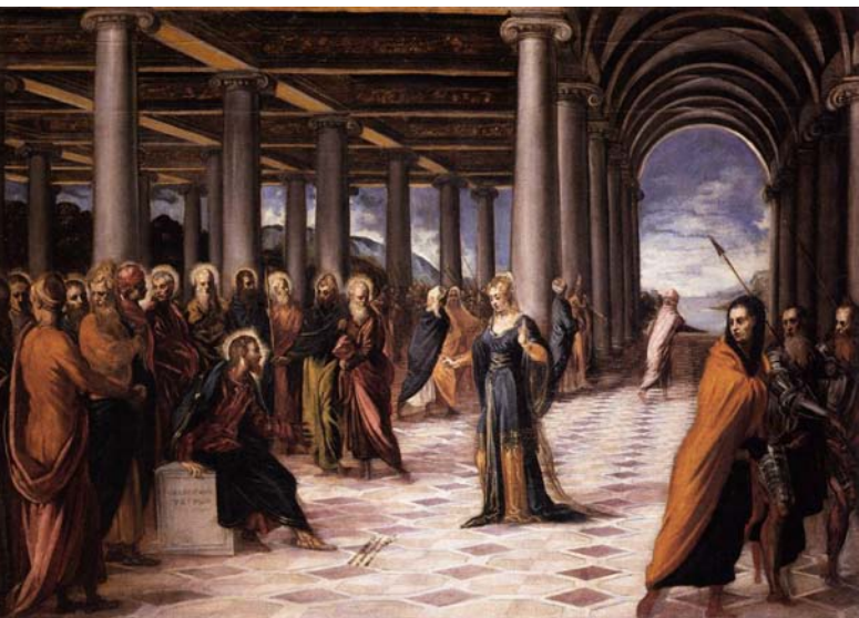
Christ and the Adulteress by Tintoretto, ca. 1546.

John 8:7–9 “He that is without sin . . . cast a stone” Jesus’ answer put the burden back on his questioners. It is also a good example to us on handling unrighteous judgment—leave it alone. I think it is admirable that the accusers were honest enough with themselves to allow their consciences to convict them. Or perhaps they may have left because Jesus did not respond as hoped. The point is that we are all sinners.