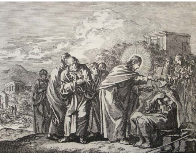
The Healing of the Man Born Blind. A an etching by Jan Luyken

through this conversation, the healed man strengthens his faith by defending Jesus and coming to ultimate truth. Interestingly, the persecution increases his belief. This conversation has similarities with what the Lord taught Nicodemus. Both include an uncertainty about the Divinity of Jesus and both initially do not hear with faith. (Fortunately, Nicodemus developed more faith later and became a key figure at the cross.)