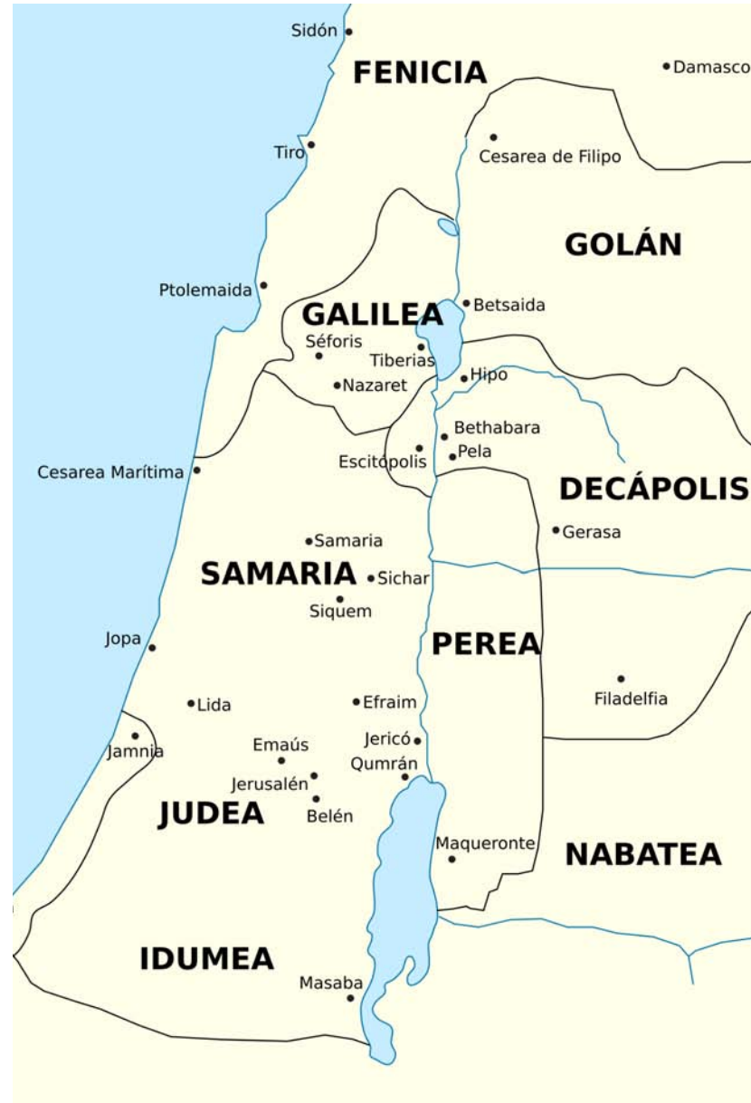
Map of first-century Palestine.

After the resurrection, we see Jesus’ family more actively involved in the growth of Christianity. His brother James became the Bishop, evangelist, or leader in Jerusalem, and possibly even later an apostle. 2 Tradition holds that he also became the author of the book of James. In AD 62, James’ was such a strong leader for Christianity that the Sanhedrin had him stoned. According to the Jewish historian Josephus, Ananus, “assembled the Sanhe-