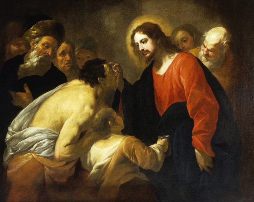
Healing of the man born blind by Orazio de Ferrari.

are a result of sin, that even the disciples needed correction. By blaming all handicaps or hardships on sin these Jews forgot or misunderstood the book of Job.