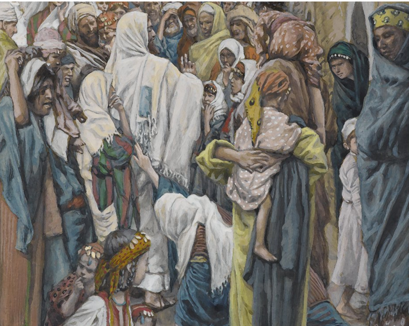
The Woman with an Issue of Blood by James Tissot

Below is the outline of these chapters in the synoptic Gospels. 3 Then we will go through each following Matthew’s order.