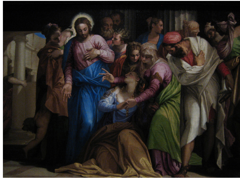
Christ Healing a Woman with an Issue of Blood by Paolo Veronese.

Matthew 9:20; Mark 5:25; Luke 8:43 An issue of blood made this woman ritually unclean (Leviticus 15:19). Additionally, for the last twelve years, all that she touched would be unclean. So, she was undoubtedly ostracized, as literally an "untouchable," for twelve years. According to Jewish oral laws, this meant that she could not go out in public, could not worship in the synagogue, and could not share her husband's bed, and her social position dropped drastically. As a result of this, she was more than likely accused by her neighbors and family of some wickedness that brought on her "uncleanliness." Her husband would have divorced and left her, and she would have been utterly destitute (Mark 5:26). She was determined to find healing from the Lord, even if it meant breaking the oral laws that kept her from reaching out to God. Interestingly, as the "beloved physician," Luke includes a stab at his fellow physicians who take money without providing healing (Luke 8:43; Colossians 4:14; Mark 5:26 also).