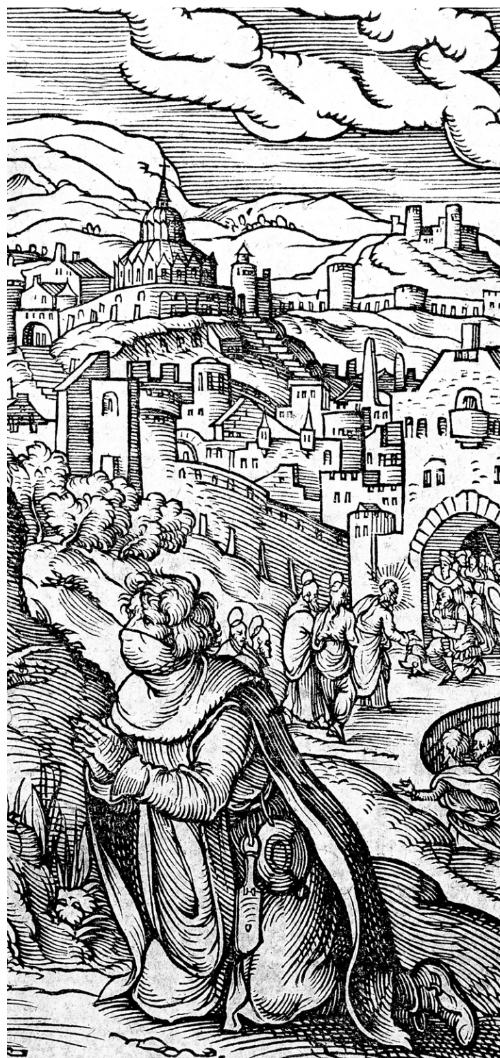
Below and opposite: Woodcut of Christ healing a leper ca 16th century. Image via Wikimedia Commons.

All three Gospels point out that Jesus complied with the Law of Moses by sending the cleansed man to “a priest” to be pronounced clean (Leviticus 14:2–3). However, He denounces the thousands of extra laws known as the “oral