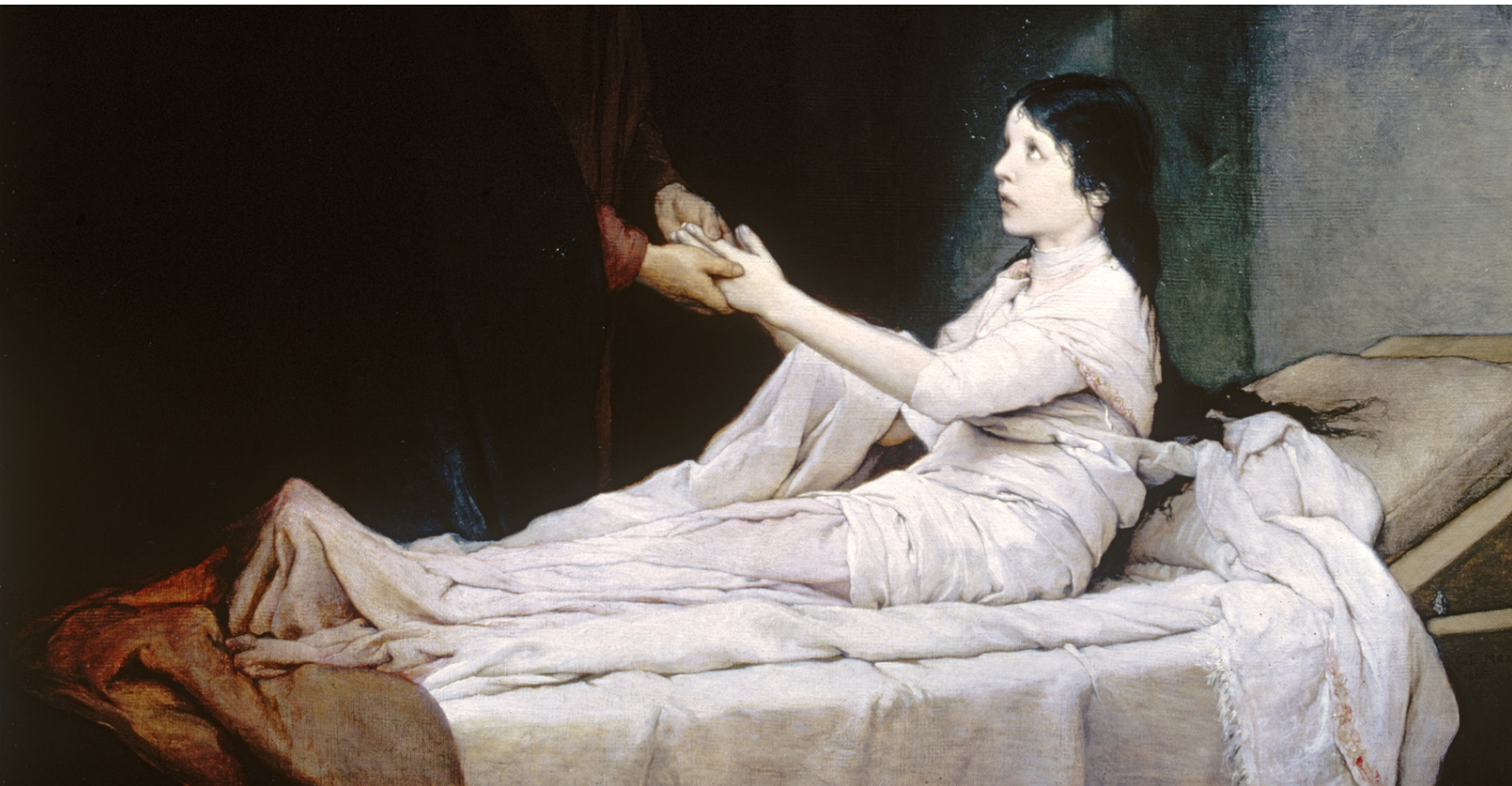
The Raising of the Daughter of Jairus by Gabriel von Max.

Matthew 9:22; Mark 5:33–34; Luke 8:47–48 The women knew she was healed and came “trembling” and fell down before Jesus. She admitted to touching His tassel (which broke several societal laws), but also boldly testified of the miracle. Jesus did not reproach her for breaching many social customs; instead, He praised her faith,