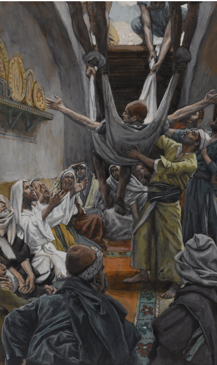
Paralyzed Man Let Down by James Tissot

Matthew 9:2–8; Mark 2:1–12, Luke 5:17–26