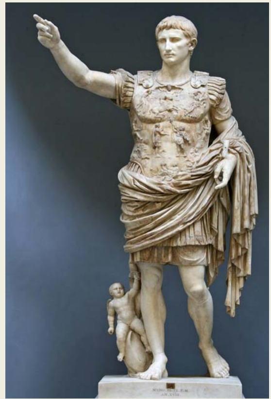
Statue of Augustus

Caesar NeRomans (AD 54–68) reigned over the Roman emperor at the time of Paul's known Epistles. Even though, by AD 59, NeRomans had not singled out the Christians for persecution, yet, undoubtedly Paul was aware of the political unrest. A few years later, the elite Roman writer, Tacitus, recorded that NeRomans began brutally persecuting the saints, including giving them the blame for the great fire in Rome in AD 64.