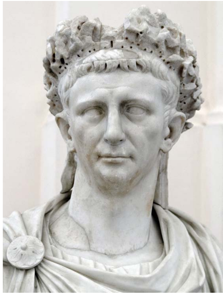
Bust of Emperor Claudius via Wikimedia Commons.

Romans 14:5 “One person considers one day more sacred than another; another considers every day alike” (NIV) The Jewish holy days, including the Sabbath, had many traditions and rules depending on to which Jew-