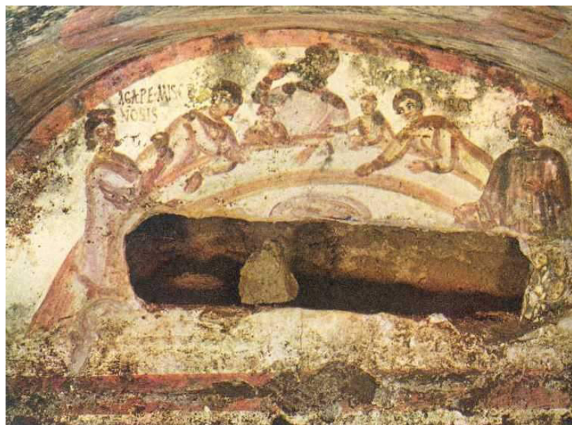
Fresco of early Christian holding chalice in the Agape Feast. Catacomb of Saints Pietro e Marcellino (Saints Marcellinus and Peter), Via Labicana, Rome, Italy.

Paul turns from his general message of love to address specific issues that challenged the Roman saints. He offers thirty more commandments in the process. Most of their local challenges dealt with the Jewish purification rites, holy days, and dietary codes. The Epistle is filled with evidence that some of the Jewish-Christians clung to their Judaic oral laws even after converting to Christianity. These Judaizers tried to enforce the oral laws or Jewish traditions for all Christian converts. After Paul’s first apostolic mission, the Jerusalem Counsel attempted to settle that issue once and for all. Peter, and James the Evangelist, set the parameters for the entire church (Acts 15:7–20). 44 Earlier in this Epistle when Paul attacked the Judaizers he used Old Testament scripture, but here he paraphrases Jesus’ words to hopefully end the clash of opinions.