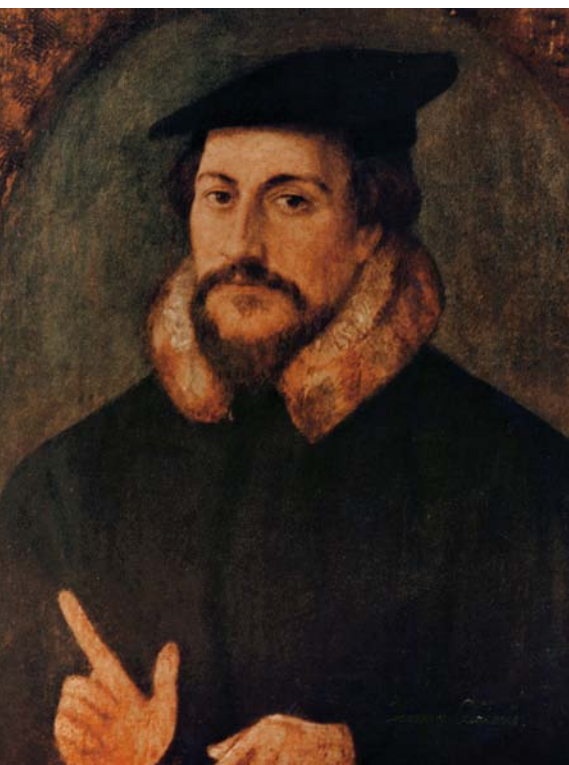
Portrait of Jean Calvin by Titian.

Romans 8:30 “. . . him whom he called, him he also sanctified ” (JST) The prophet Joseph felt inspired to change justified to sanctified. Justification refers to the working of the Spirit that applies the Savior’s atonement in our lives (2 Nephi 2:5–6), while sanctification is the process of becoming holy and pure, by the Savior’s atonement, purging all sin from the soul (Alma 13:12; Moroni 10:33). In the restored church, we define this doctrine very differently from most Christians. We all see the Savior as key, but for us it is not a battle between faith or works. Instead, on the day the Church was organized Joseph said, “We know that justification through the grace of our Lord and Savior Jesus Christ is just and true” (D&C 20:30). And later when translating Genesis he wrote, “by the Spirit ye are justified, and by the blood ye are sanctified” (Moses 6:60). We believe both are needed.