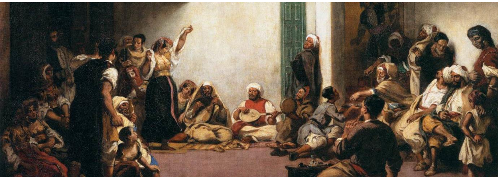
Jewish Wedding in Morocco by Eugène Delacroix.

Mt 1:19 “To put her away,” was to divorce her. A Jewish fiancé/husband could divorce his wife for a range of reasons from burning supper and infertility. It was a religious duty to divorce a woman for adultery (and anything that suggested moral uncleanness). One could arrange a divorce either publicly or privately. 10