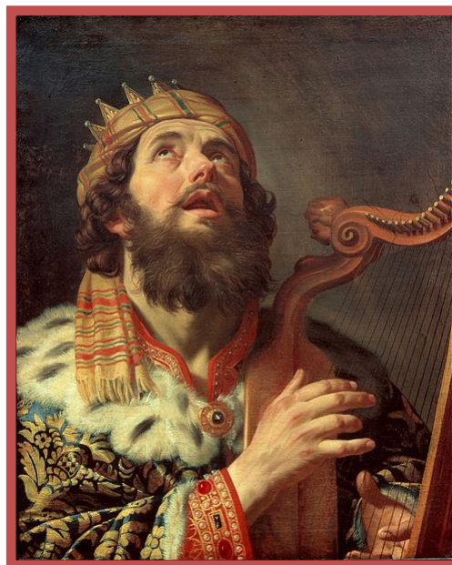
King David Playing the Harp by Gerard von Honthorst.

The rest of Matthew's birth narrative is organized around five prophetic scriptures and five dreams: