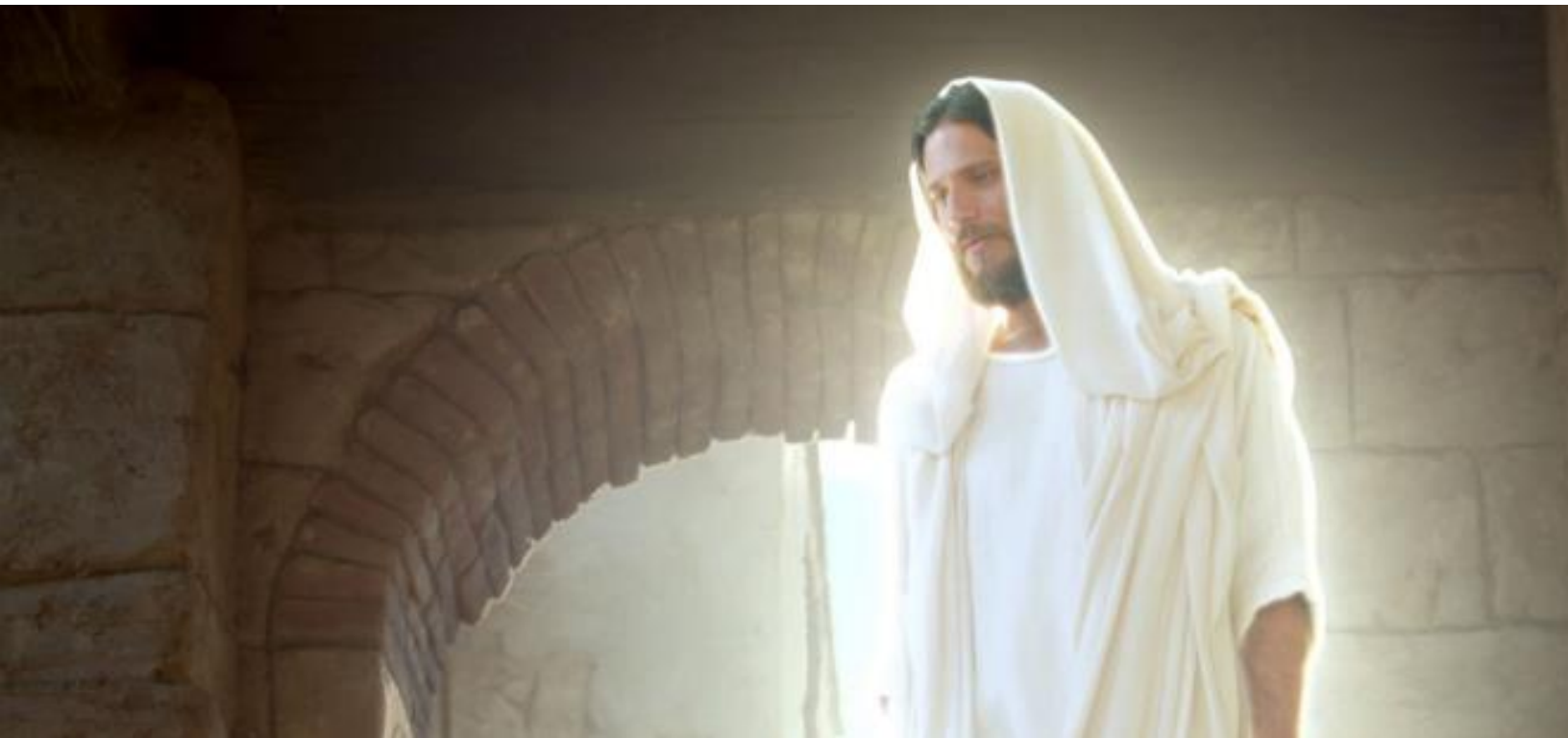
An Angel Fortells Christ's Birth.

Lk 1:31–33 Gabriel tells Mary to name the child Jesus (see 2 Nephi 25:19). Gabriel's message rings with OT scripture and the Messianic role outlined by the prophet Nathan in 2 Sam 7:9–16 (also Isaiah 9:7; 2 Sam 7:8–16; Amos 9:11). We have to assume that Mary's questioning came from a different heart than Zacharias' questions, as the outcome is different. Many English translations state her question as, "I am still a virgin." It was humanly impossible, but Gabriel explains the powerful Holy Spirit can work miracles. Mary believes, "with God nothing is impossible." The "holy thing" becomes the "Holy One of God" in Mark 1:24; Luke 4:34; and John 6:69; and the "Holy One" in Acts 3:14. Jesus is set apart and consecrated to the service of God as the Holiest of all born on the earth.