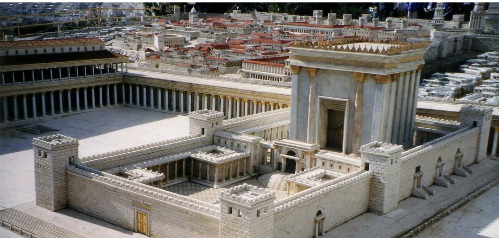
Replica of Herod's Temple. Image via Wikimedia Commons