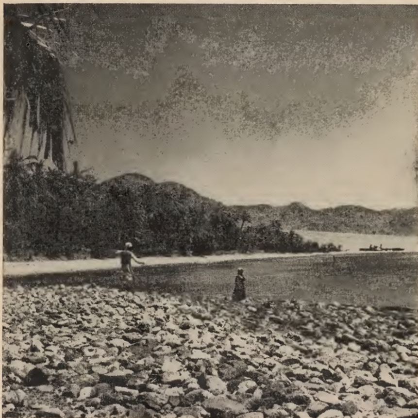
Eastern tongue of the Red Sea, near Eziongeber, in the land of Edom.

Nephi was much impressed by Laban's sword: