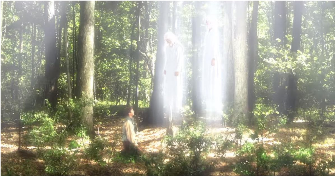
Figure 3 Image from Ask of God: Joseph Smith's First Vision .