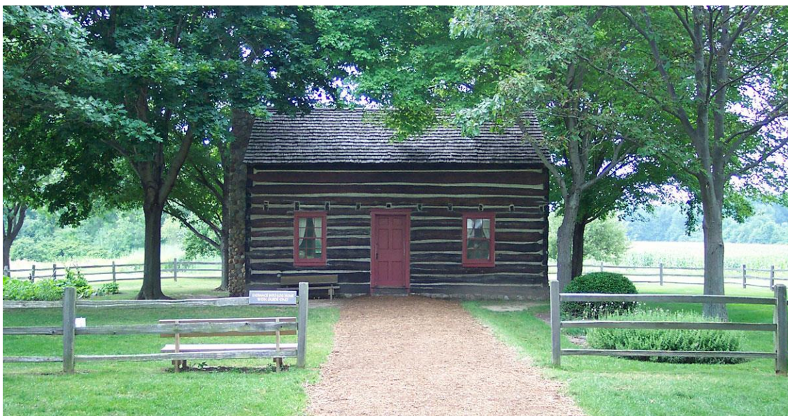
Figure 4 Peter Whitmer cabin in Fayette, New York.

For a further analysis of the question, how long it took for Joseph to translate the Book of Mormon, see my recent article, " Timing the Translation of the Book of Mormon: 'Days [and Hours] Never to Be Forgotten,' " BYU Studies Quarterly 57 no. 4 (2018): 10–50.