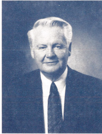
This banquet, held each fall, gives FARMS volunteers, staff,

The banquet is scheduled for the evening of Wednesday, 20 November, and will be held at the Provo Park Hotel. A reception will begin at 6:30 P.M., followed by the dinner at 7:00 P.M. Free parking is available in the hotel parking garage.