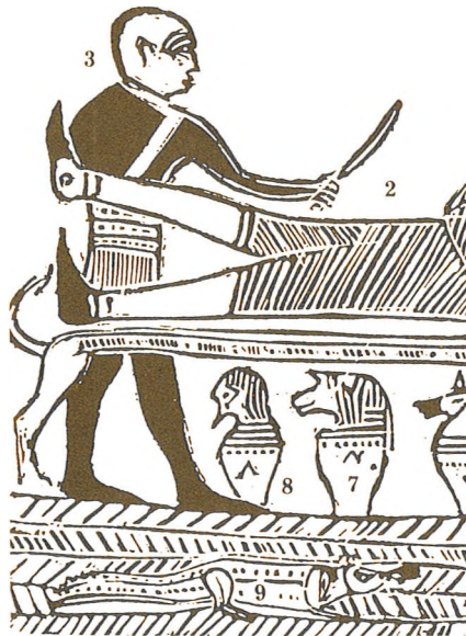
Detail of Facsimile 1 from the book of Abraham, showing the crocodile god

Though in Mercer's day scholars studied both Mesopotamian and Egyptian disciplines, they knew nothing of the interactions between the two cultures. In 1971, however, the Egyptologist Georges Posener completed a lengthy and detailed survey of the available evidence and concluded that cultural interactions and interference of Egypt in the area of Syria and Palestine were extensive, even though the precise nature of the "domination by the pharaohs" during the Middle Kingdom "still eludes us; fifty years ago it was barely suspected." 3 Yet some critics who