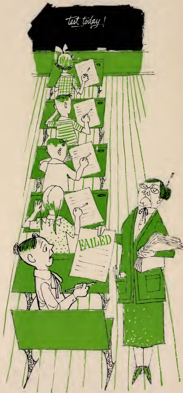
Failed to pass a test which was never given because of failure to pass it.