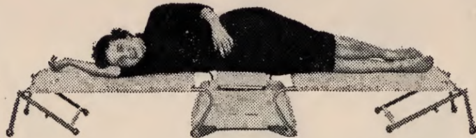
STAUFFER'S "MAGIC COUCH"® in the beautiful new Princess Model