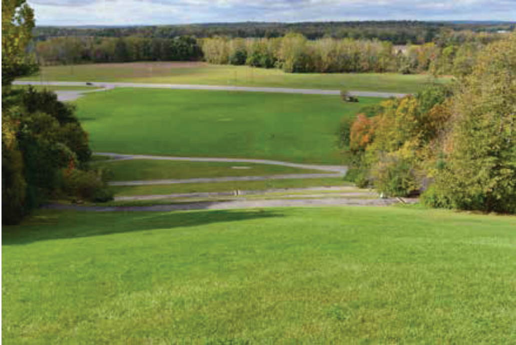
Image 13. The view facing west from the north end of the Palmyra hill.