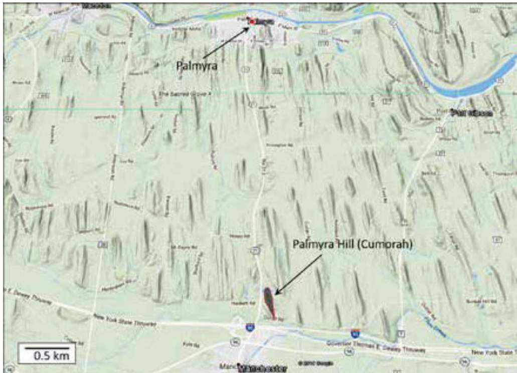
Image 4. The drumlin field in the area. Graphic courtesy B. Jordan.

flow direction. 5 The highest point of the Palmyra hill lies, therefore, at its north end, with the long slope of the hill tapering away to the south.