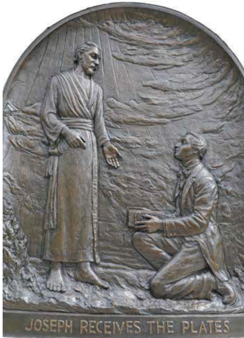
Image 1. Joseph receives the plates from Moroni. Relief on the west side of the monument atop the Palmyra hill.

the careful reader that the real-world setting was not — indeed could not — have been situated in New York state. 2 Accordingly, for clarity throughout this paper, the New York hill where the plates were buried by Moroni is referred to as the “Palmyra hill.”