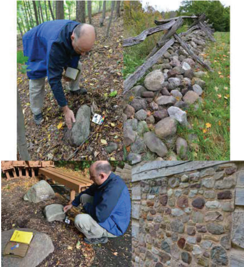
Image 6. The survey examined local rocks from a variety of settings. Clockwise from top left: in situ on the Palmyra hill, rocks cleared from fields, rocks incorporated into landscaping, and rocks incorporated into buildings.

It is worth noting, though, that as Oliver said the cement was prepared and placed in such a way that the rocks were “cemented so firmly that the moisture from without was prevented from entering,” the type of rock was likely important for another reason. One advantage in using granite over sandstone is that granite is generally much less porous than sandstone, thus sealing out moisture more effectively. This, coupled with the porous nature of the unconsolidated sediments that form the hill, would have allowed efficient water drainage from around the stone box. Any moisture that did not drain away would be kept from the box interior by the fine cement and the stone sides shaped, most likely, of granite.