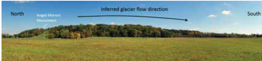
Image 5. Panoramic photograph showing the profile of the Palmyra hill, facing east.

On the other hand, faster water flow would likely have led to more rapid erosion in addition to the natural creep of soil downhill over time. Thus it is possible, if not likely, that the stone box was buried deep enough by Moroni to be completely covered by soil until erosion exposed its upper surface by Joseph's time.