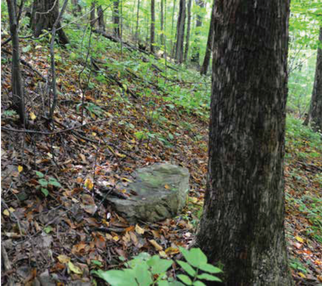
Image 2. A general view, facing south, of the west side of the Palmyra hill, near the summit. This is the general area where Moroni buried the plates. Large flat-faced rocks, like those shown in the foreground, are common on the hill.