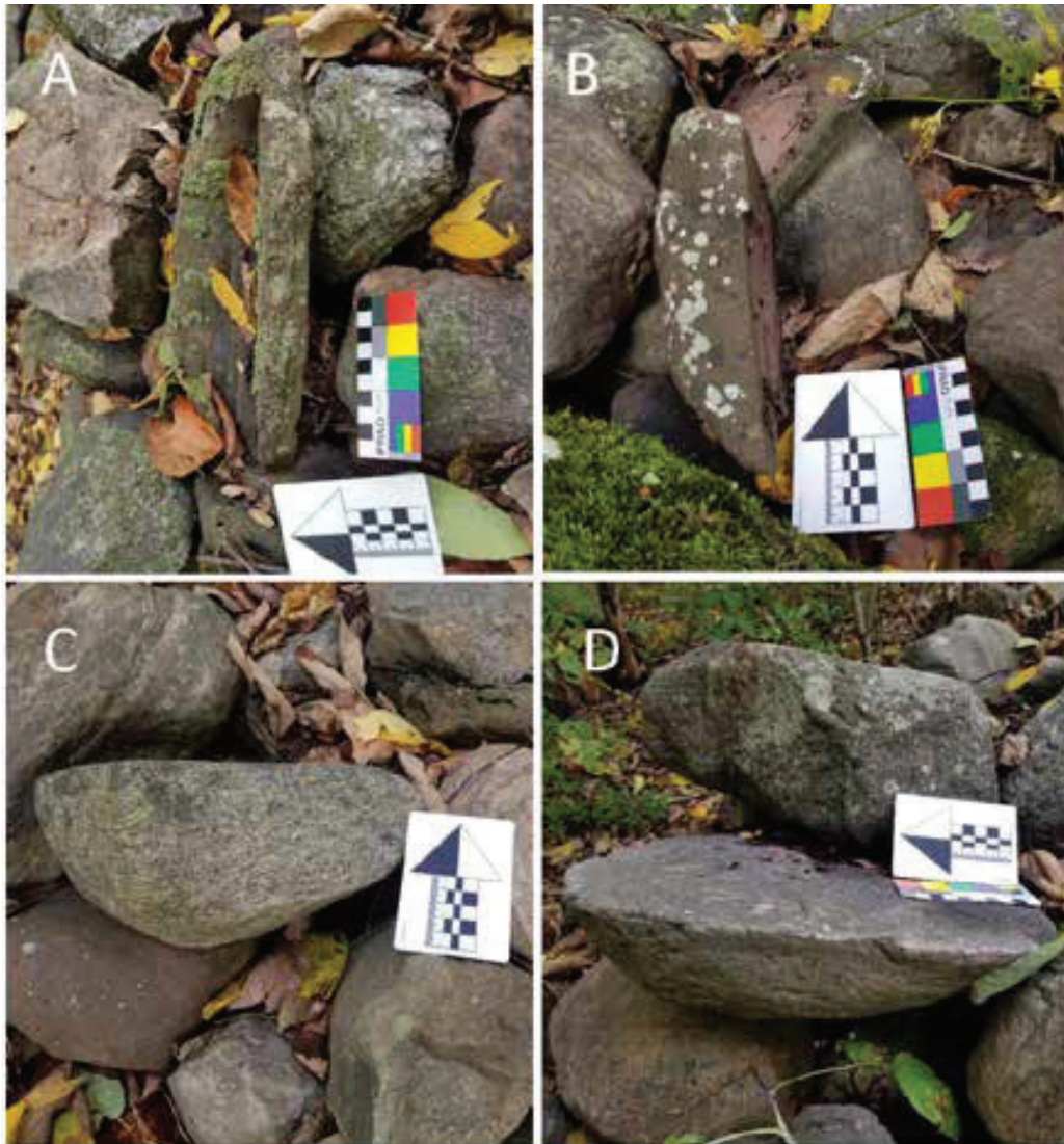
Image 7. Rocks found in the vicinity of the Palmyra hill fitting the description of those used to make Moroni's stone box. Images A and B consist of rounded, but delaminated, sandstone. C and D are rounded cobbles of granite.

Our investigation to determine if rocks, as described by eye-witnesses , were available in or near the place of burial to form the box demonstrates clearly that they were and, indeed, still are.