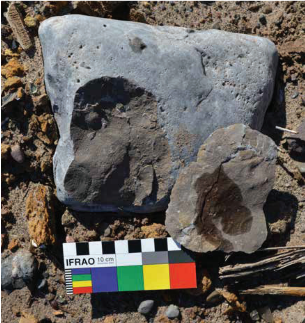
Image 8. A large cobble of Limestone with the interior exposed.

Producing lime in the pre-industrial period was a process that involved cooking pieces of limestone on a wood fire. Once the wood burnt down to charcoal, temperatures of up to around 1,600° C (~2,900° F) were reached. 13 This resulted in a chemical reaction producing globules (“clinkers”) of calcium silicate ( \text{Ca}_2\text{SiO}_4 ); after cooling, water added to the material made it expand to a powder of around 5 or 6 times the volume of the limestone. This was the cement which, added to an aggregate and water, formed concrete.