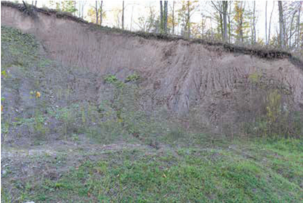
Image 12. Miner's Hill in Palmyra is a rare drumlin consisting of fine clay.