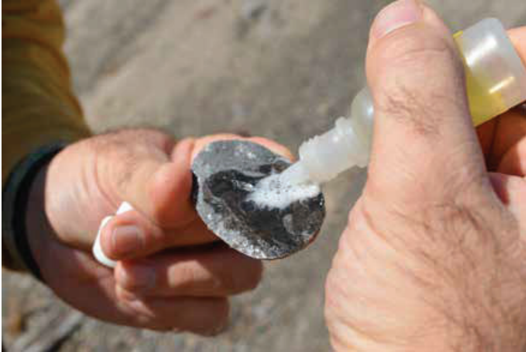
Image 11. Testing limestone with diluted hydrochloric acid.

owner, who allowed the New York Highway Department to mine it, it is the only location in the area that serves as a source of clay.