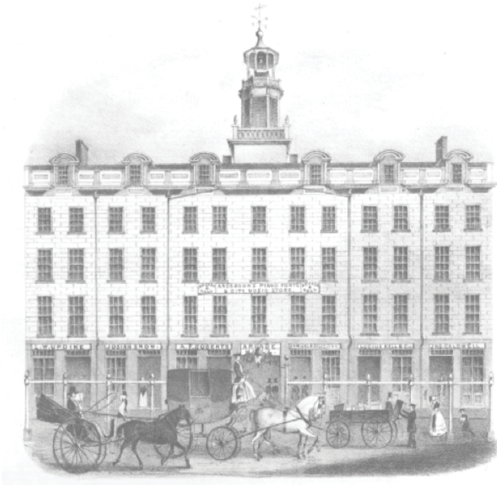
Figure 2. Reynolds Arcade, from an 1844 sheet music publication. 15

With the construction of the Barge Canal in 1918, the canal was moved south of the city of Rochester. Since the Genesee River Aqueduct was no longer needed, a road deck for Broad Street was built atop the aqueduct in 1922–1924, and the aqueduct was modified internally to carry the tracks of the Rochester Subway (or Rochester Industrial and Rapid Transit Railway) from 1927 to 1956. The Broad Street Bridge deck was rebuilt as it stands today in 1973–1974. 14