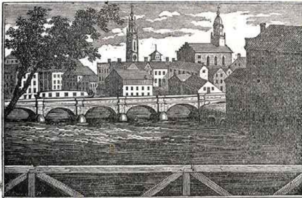
VIEW OF ROCHESTER WITH A SECTION OF THE AQUEDUCT.