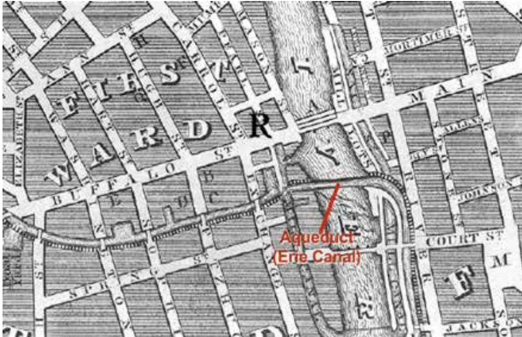
Figure 3. Detail of an 1827 map by Elisha Johnson as marked by Grunder. The R is the location of the Reynolds Arcade; I added the label for the aqueduct. 16