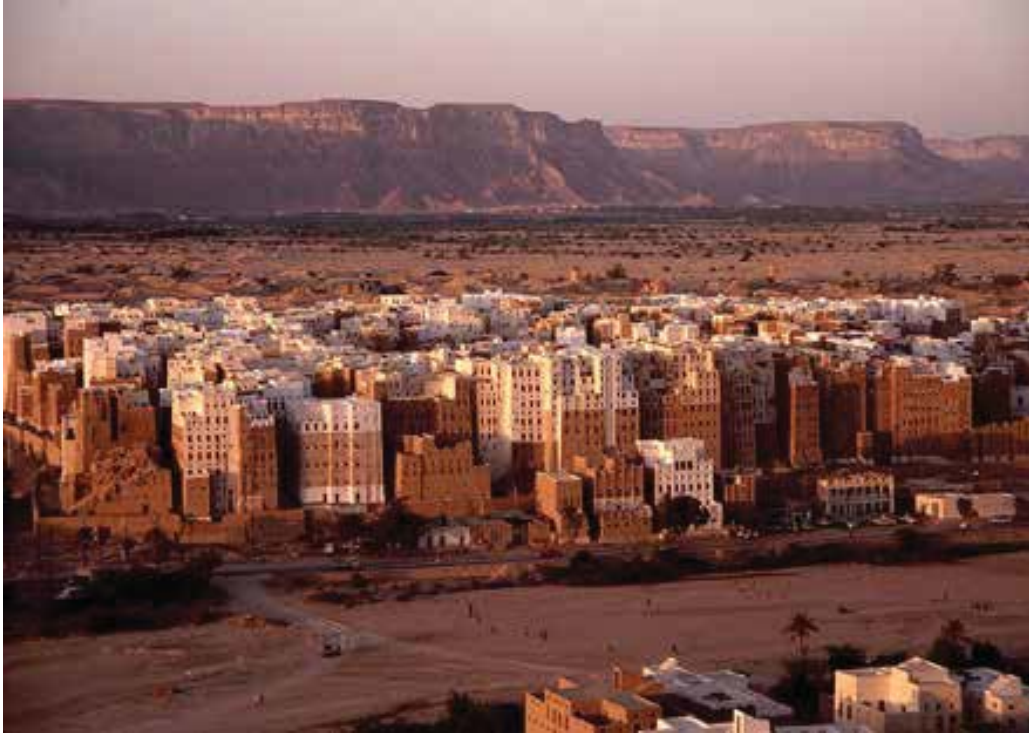
Figure 6. Modern Shibam reflects the ancient Yemeni tradition of multistory buildings. 161

this aspect — for what the family would yet experience in Arabia. To be sure, the dream was highly symbolic. Yet it also corresponds in some of its prophetic dimensions to historical and geographical realities. 160