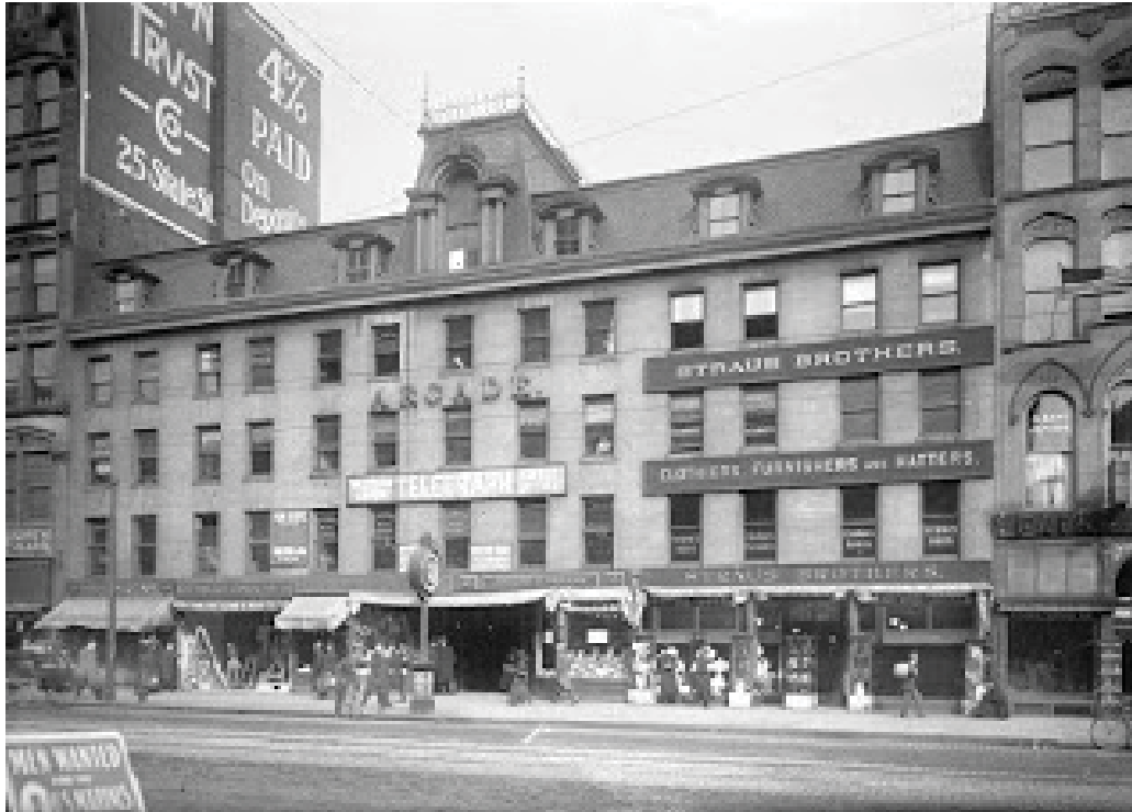
Figure 1. The great and spacious Reynolds Arcade in Rochester. The observatory on top was missing at the time.