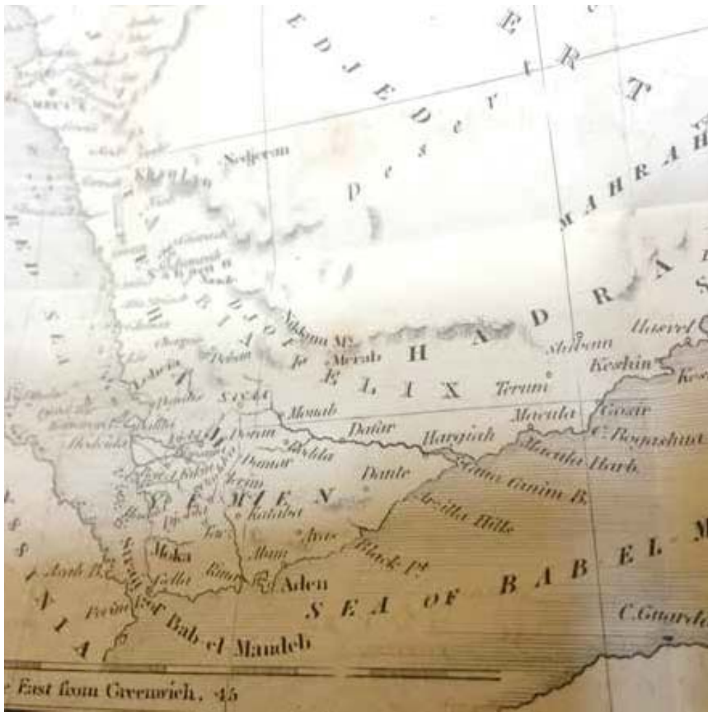
Figure 5. A section of Josiah Conder's 1825 map of Arabia from The Modern Traveler , courtesy of Rooke Books, Bath, England. The Nikkum Mountains are near the center, northeast of Sanaa.

If Joseph had been able to access Conder's volume on Arabia to study its map, what would he have gained? A limited resolution version of the map in black and white only is available online, 31 and a small version of Conder's full 1825 map is available online from Rooke Books of Bath, England, 32 who own of a copy of Conder's 1825 original. The owners of Rooke Books kindly provided a photograph of the region around Sana'a (Figure 5) to help me see if Nehem , Nihm , Nehm , or some other word related to ancient Nahom can be seen. 33