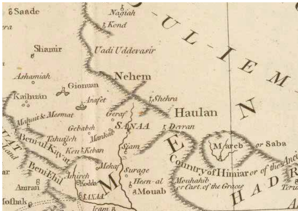
Nehem detail on the 1794 D'Anville map of Arabia by Laurie and Whittle.

Here are relevant portions of the Laurie and Whittle map published in London in 1794 by Laurie and Whittle, based on the work of D'Anville with added material from Niebuhr. It can be viewed in detail at DavidRumsey.com. 225 Here is a portion showing Nehem: