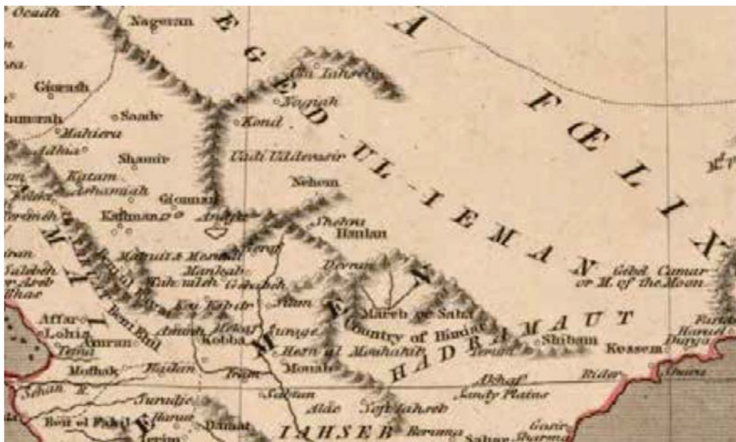
Nehem region detail on the Kirkwood map.