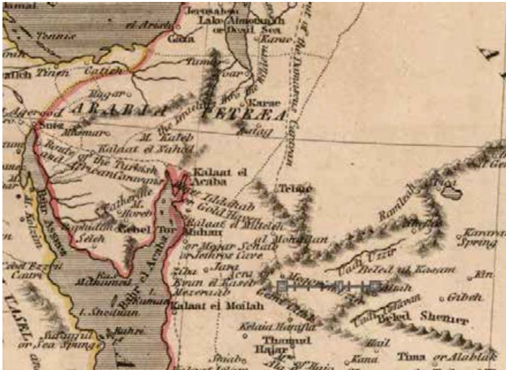
Gulf of Aqaba region detail on the Kirkwood map.