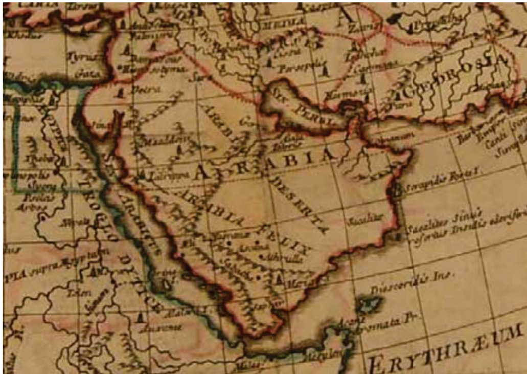
Detail from d’Anville’s “Orbis Veteribus Notus” provided with his book, Géographie Ancienne Abrégée .

The Compendium is a translation of a French work, Géographie Ancienne Abrégée , 260 which included nine maps, but no map showing Nehem. The only full view of Arabia is on “Orbis Veteribus Notus,” a map of much of the Western Hemisphere which shows the full outline of Arabia and some cities and mountains, but makes no mention of Nehem. A portion showing Arabia is depicted in the detail below taken from a version of the map on a vendor website. 261 His map of the Roman world and Byzantine empire (“Orbis Romani”) shows much of Arabia also with little detail. A small portion of Arabia next to the Red Sea is shown in the map of the 12 tribes (“Les Tribus”), again with little detail. There is no hint of Nehem or related names on the maps or in the text.