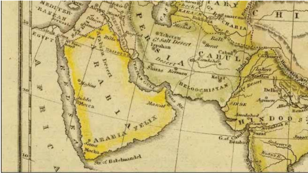
Arabia on the world map of Jedidiah Morse.

While I am not sure if this map actually arrived anywhere near Joseph, a book with a related map and more detail than Geography Made Easy was listed in the Manchester Library, where Joseph theoretically could have gone (though he was not a subscriber to this subscription-based library). 211 Morse's The American Universal Geography has an entire chapter on Arabia and has a black-and-white map of the Eastern Hemisphere at the beginning that appears to have roughly as much detail as the color map of 1828. 212 The small section on geography still offers little that could help Joseph in concocting a journey that would later be found to be vastly more plausible than it seemed. There are more names: Medina, Mecca, Mocha, Suez, Oman, Aden, Yemen, Gehhra, Katif, Merab, Kasim, Maskat, Rostak, Labsa, Seger, Dafar, Hodeida, Faitach, and the leading city of Saana [sic], said to be at the bottom of a mountain called Nikkum 213 (a hint of Nahom?) There is also a description of the terrain: