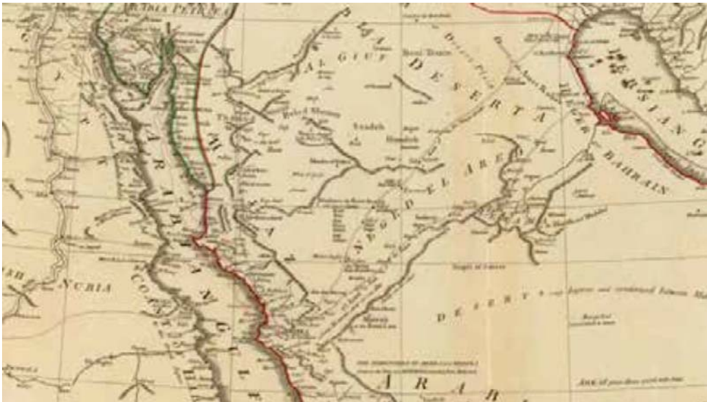
Red Sea detail on the 1794 D’Anville map of Arabia.

Zooming out further, here is more of the map also showing the Red Sea.