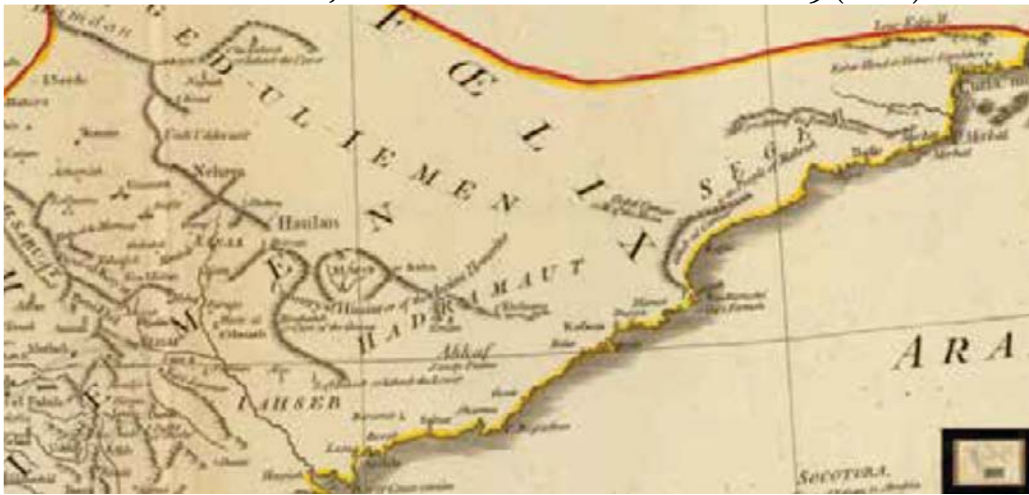
Dofar region detail on the 1794 D’Anville map of Arabia by Laurie and Whittle.

Zooming out further, here is more of the map also showing the Red Sea.