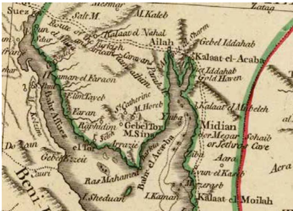
Gulf of Aqaba detail on the 1794 D'Anville map of Arabia.

Zooming in around the Gulf of Aqaba, notice the many details that Joseph could have used to enhance the story: