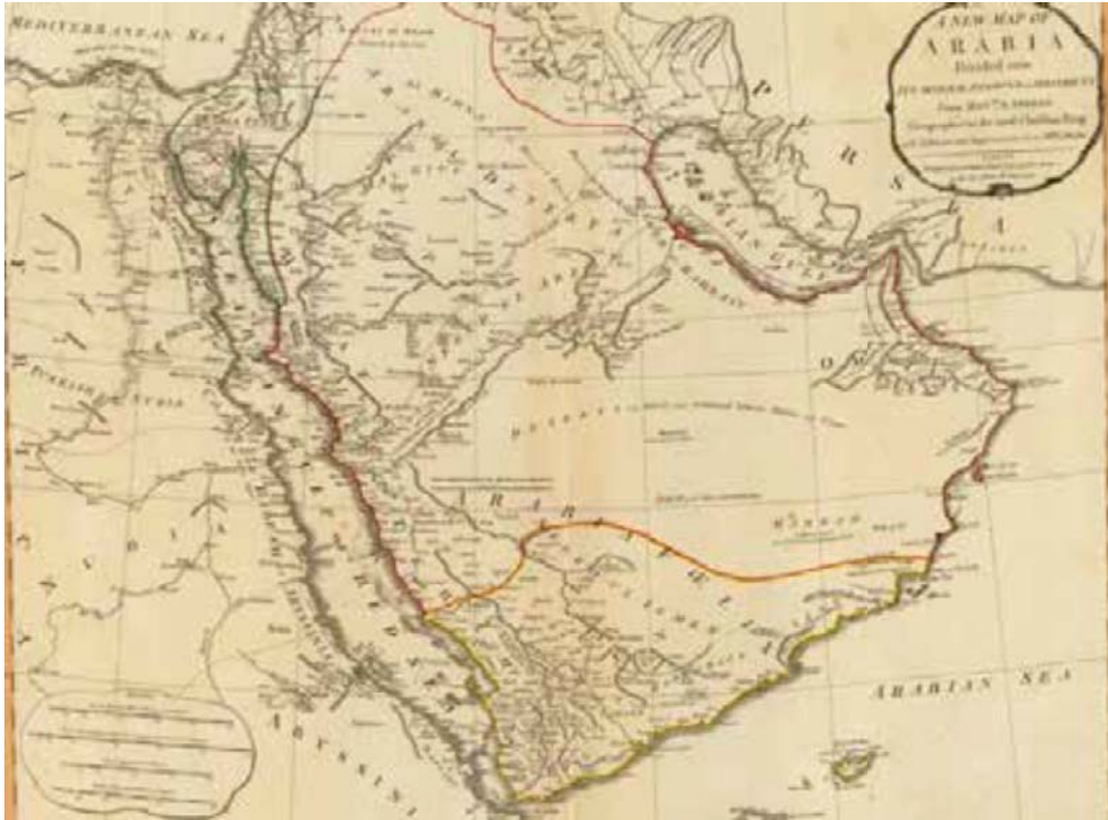
The 1794 D'Anville map of Arabia.

Zooming in around the Gulf of Aqaba, notice the many details that Joseph could have used to enhance the story: