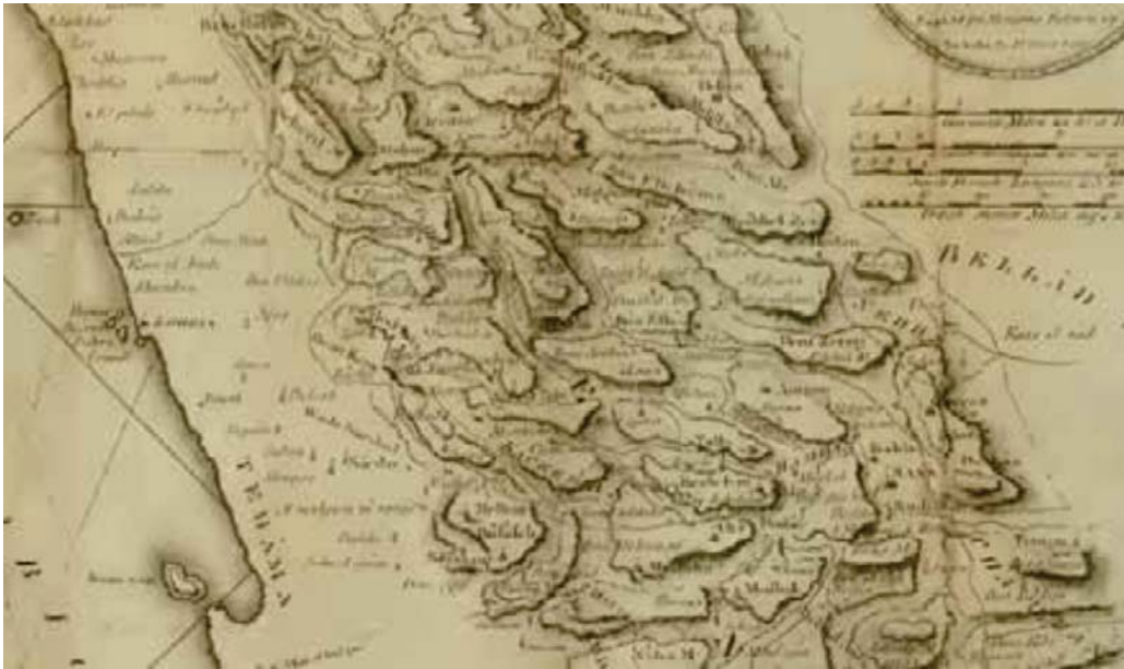
Detail of Niebuhr’s map of Yemen.

Here is a detail showing the region “Nehhm” just below “Bellad” on the right-hand side.