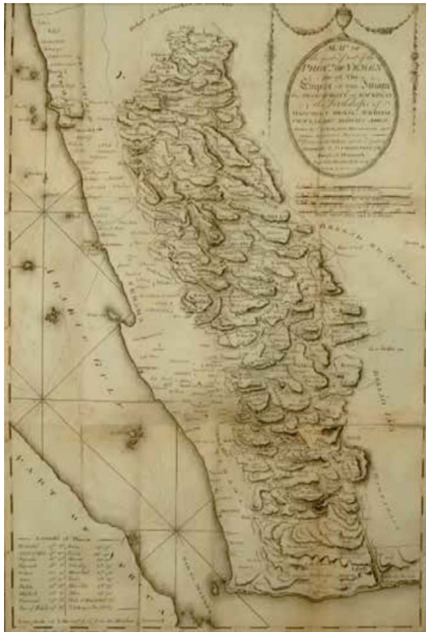
View of Niebuhr's Map of Yemen, as printed in his 1792 Travels Through Arabia, 219

visited that had a book by Niebuhr on Arabia. 218 The more distant library at Allegheny College (three hundred twenty miles from Harmony Township, Susquehanna County, or over two hundred miles away from Palmyra) had the book in English, while the closer Philadelphia library, one hundred seventy miles from Harmony Township, had it in French. Yes, in theory, Joseph could have traveled to remote libraries to track down Niebuhr's work, or perhaps a stranger or friend came through town with a book for the insatiable bookworm to relish. But does Neibuhr's map help? Here is the printed fold-out map bound inside his 1792 book.