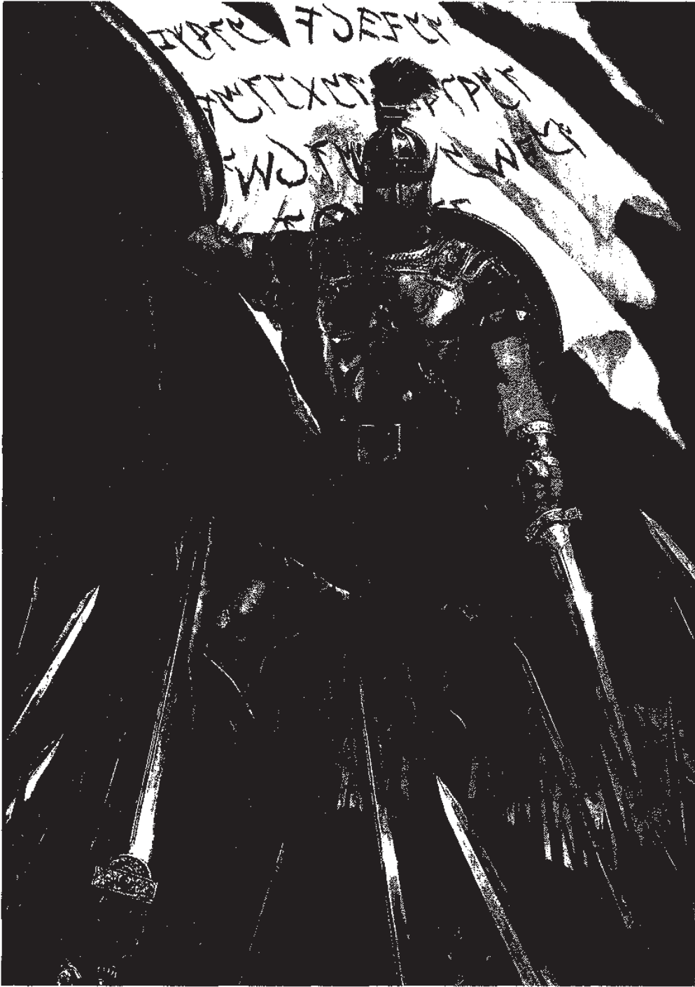
Painting by Arnold Friberg, Captain Moroni and the Title of Liberty