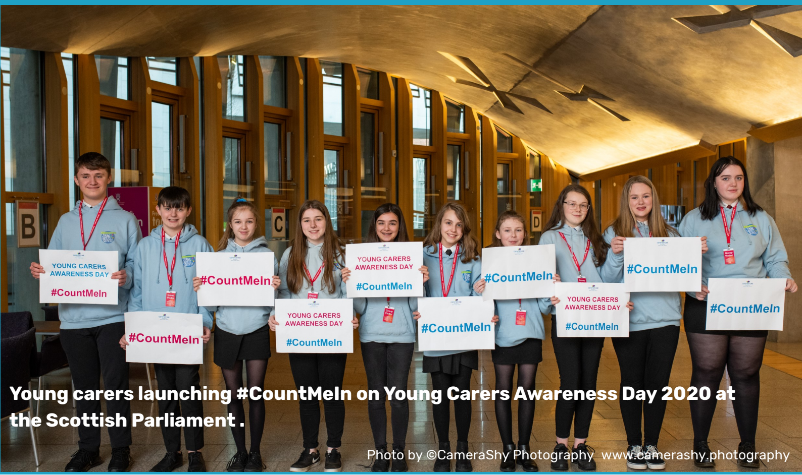
Young carers launching #CountMeIn on Young Carers Awareness Day 2020 at the Scottish Parliament .

Young and young adult carers across Scotland have consistently called for better support to enable them to live happy, healthy, fulfilling lives. This research demonstrates the need, now more than ever, to listen to and act on their call.