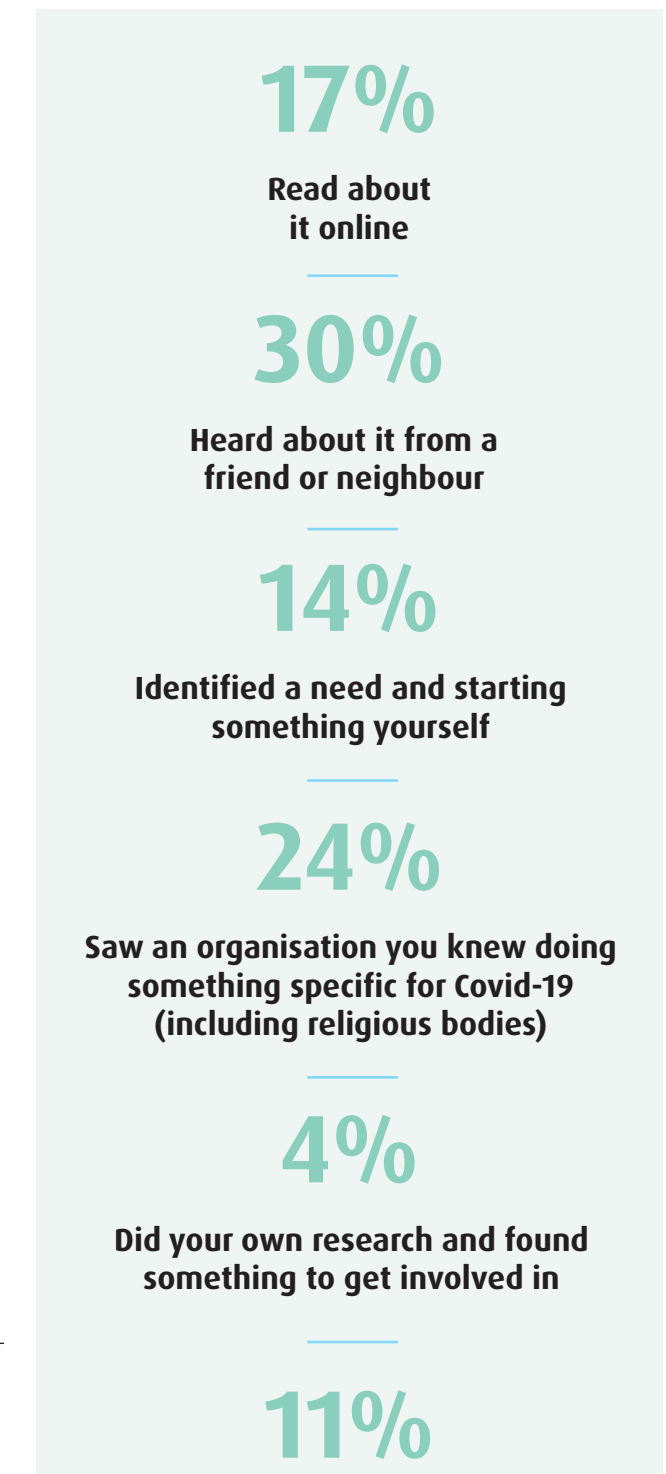
Table 3: How people found out about social action (% of participants who chose this answer):

Participants who replied "other" stated they had taken part after reading about it in a local newspaper, receiving a flyer through their door, after their workplace was approached to get involved or through their school.