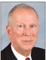
Head Coach STEVE FISHER

PPG: 3.5 RPG: 5.7 APG: 0.3 FG%: 51.2 3FG: 0.0 FT%: 19.2