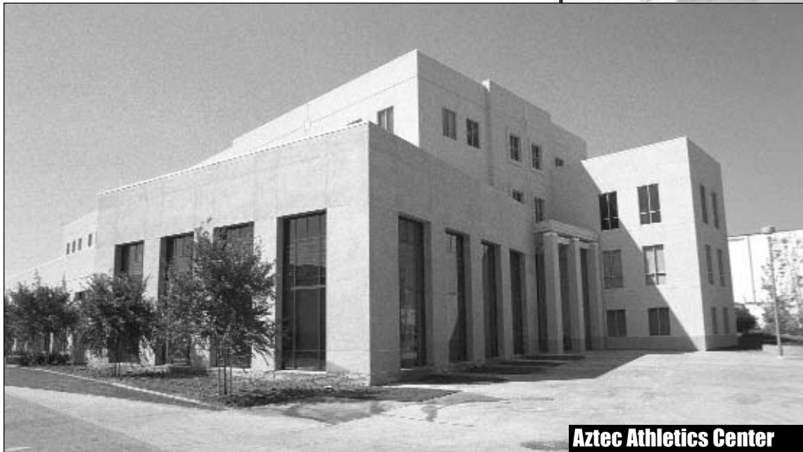
Aztec Athletics Center

► The academic center, complete with two lecture halls, private tutorial rooms, and a new computer lab, is housed on the third floor. That level of the building is also home to the athletic administration and the basketball staffs.