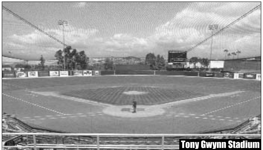
Tony Gwynn Stadium