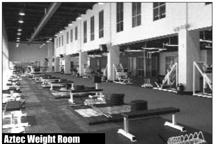
Aztec Weight Room