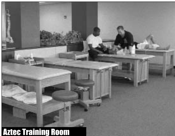
Aztec Training Room