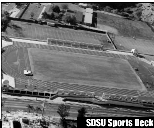
SDSU Sports Deck