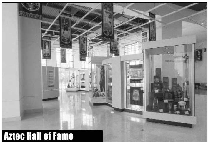
Aztec Hall of Fame