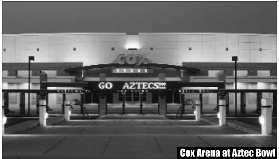
Cox Arena at Aztec Bowl