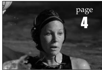
Table of Contents .....1 2006 Team Roster .....1 Season Outlook .....2 Coaching Staff .....3 Meet The Aztecs .....4-9