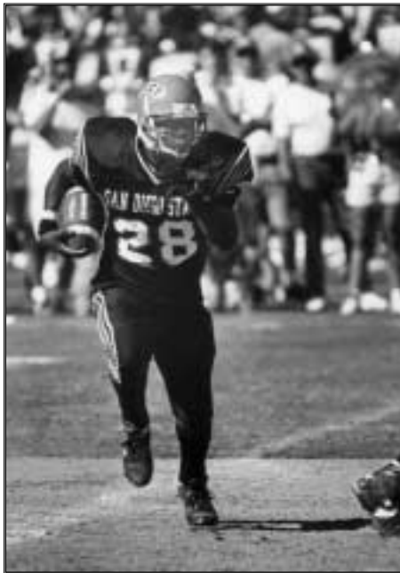
Marshall Faulk owns the SDSU top mark for most rushing yards in a game with 386 versus Pacific.