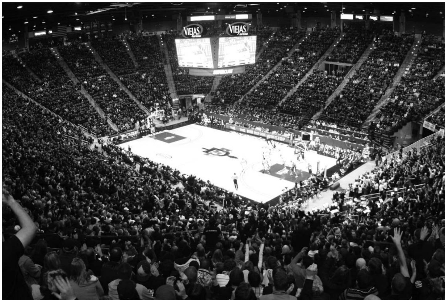
In 2010-11, San Diego State sold out 13 of its 15 home dates. Prior to the season, the Aztecs played in front of eight sellouts in the 13 previous seasons at Viejas Arena. SDSU averaged a school-record 11,668 fans, the highest average attendance among all Division I universities in California.

2011 NCAA SWEET 16 ► BACK-TO-BACK MOUNTAIN WEST CONFERENCE CHAMPIONS