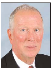
Head Coach STEVE FISHER

PPG: 9.3 RPG: 6.1 APG: 1.0 FG%: 41.8 3FG: 30.0 FT%: 56.5