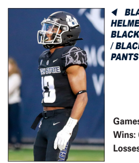
2019: vs. BYU (L) 2021: vs. BYU (L), vs. Wyoming (L)

2014: at Colorado St. (L) 2015: at San Diego St. (L) 2017: at Wisconsin (L) 2018: at Boise St. (L) 2019: at Fresno St. (W) 2020: at Nevada (L) 2021: at Washington St. (W); at New Mexico St. (W) 2022: at Alabama (L); at BYU (L) 2023: at UConn (W); at San José St. (L)