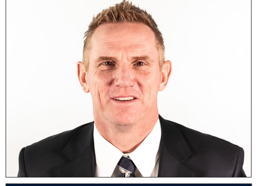
/// THE ANDERSON FILE ///