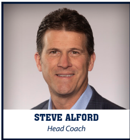
STEVE ALFORD Head Coach