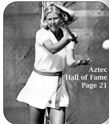
Aztec Hall of Fame Page 21