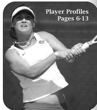
Player Profiles Pages 6-13