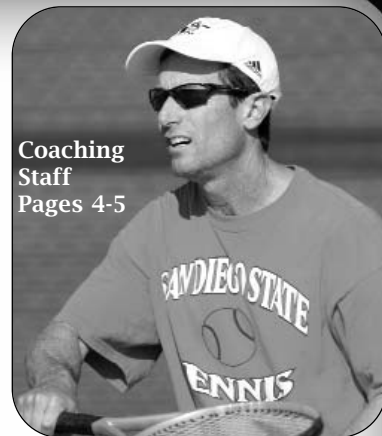
Coaching Staff Pages 4-5