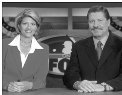
Jeanne Zelasko and Kevin Kennedy

Michael Cage , former NBA basketball player Dennis Conner , America's Cup-winning sailor Mark Grace , former Arizona Diamondbacks baseball player Tony Gwynn , former San Diego Padres baseball player/former Aztec baseball coach Fred Dryer , former Los Angeles Rams football player/actor Marshall Faulk , former NFL MVP and 2011 Pro Football Hall of Fame Inductee Stephen Strasburg , 2009 MLB No. 1 overall draft pick, current Washington Nationals pitcher Kawhi Leonard , San Antonio Spurs forward/guard, two-time NBA Defensive Player of the Year, 2014 NBA Finals MVP Joe Gibbs , former Washington Redskins football coach, founder Joe Gibbs Racing Graig Nettles , former New York Yankees baseball player Brian Sipe , former Cleveland Browns football player/former Aztec assistant football coach Mark Reynolds , sailor, four-time Olympian, two-time Olympic gold medalist, three-time world champion Marla Runyan , 1991-1994-2000 Olympian, visually impaired marathon runner Gene Littler , former PGA tour golfer, winner - 1961 US Open Kevin Kennedy , Fox Sports baseball analyst, former major league manager