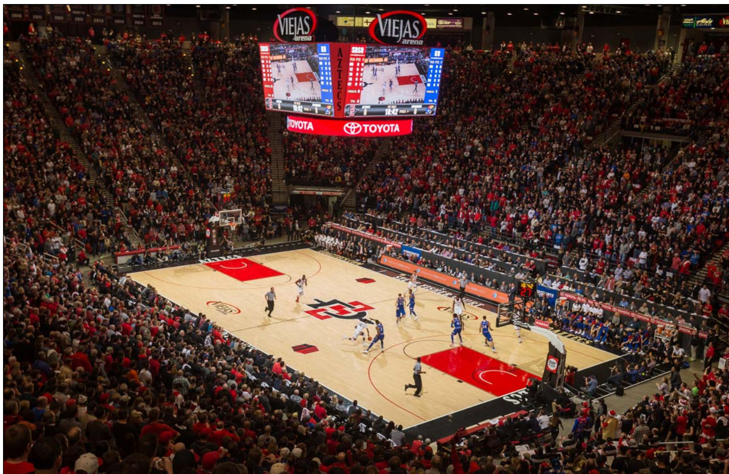
In each of the last four seasons, San Diego State has sold out its entire home slate prior to the start of the campaign. Entering 2016-17, the Aztecs have played in front of 72 straight regular-season sell-out crowds. After averaging 12,210 fans in 2015-16, SDSU led the state of California in attendance for the sixth straight year.