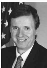
Timothy J. Muris