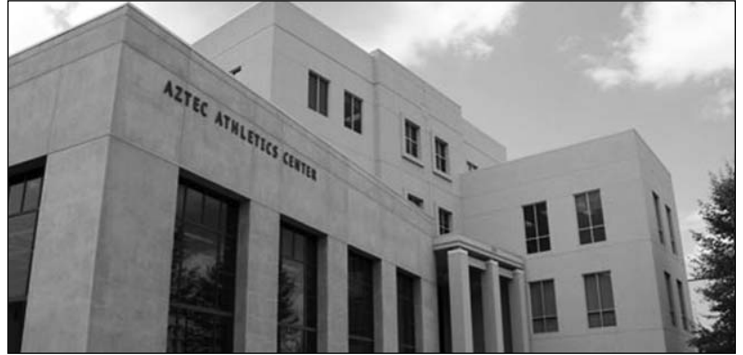
AZTEC ATHLETICS CENTER