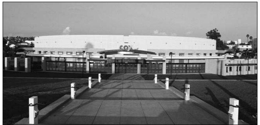
COX ARENA AT AZTEC BOWL