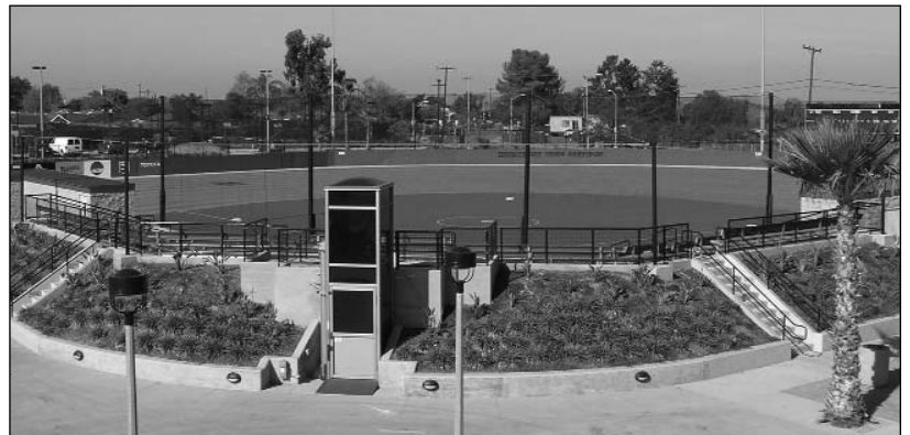
SDSU SOFTBALL STADIUM