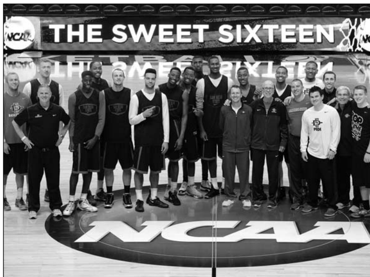
San Diego State advanced to the NCAA tournament's Round of 16 in Anaheim, Calif., after defeating New Mexico State and North Dakota State in the second and third rounds, respectively, in Spokane, Wash.

San Diego State made its we-are-here statement at the Wooden Legacy where it beat No. 20/18 Creighton and No. 25/rv Marquette in consecutive