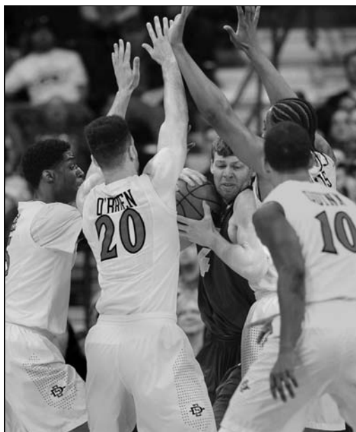
San Diego State held its opponents to 57.0 points, 38.6 percent field-goal shooting and 28.8 percent from behind the three-point arc, all of which were school records.

2014 NCAA SWEET 16 ► FIVE CONSECUTIVE NCAA APPEARANCES ► EIGHT-TIME MW CHAMPIONS