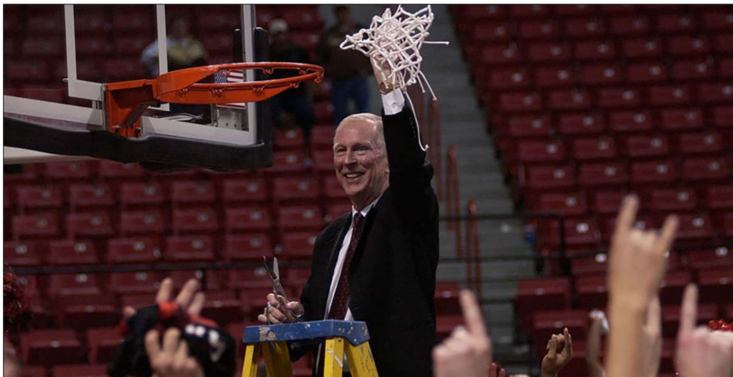
Head coach Steve Fisher cut down the nets after the Aztecs' 78-75 victory over UNLV in the 2002 Mountain West Conference tournament championship game at Thomas & Mack Center. The victory propelled San Diego State into its first NCAA Tournament since 1985 and marked the eighth NCAA tournament appearance of Steve Fisher's career.