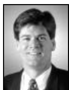
Craig Thompson Commissioner