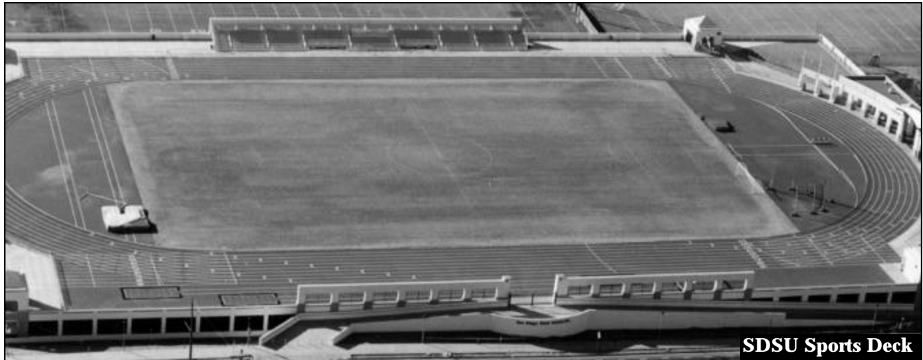
SDSU Sports Deck

"When there's no room to build out...build up." That's the mantra of modern-day engineers and contractors and is something San Diego State took to heart when designing its soccer/track facility. The five-year old, $13 million SDSU Sports Deck sits atop the university's newest two-story parking structure (PS 5). The facility is located at 55th Street and Montezuma Avenue at the site of the old Choc Sportsman Oval.