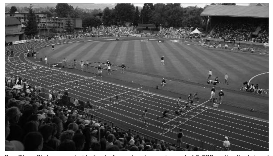
San Diego State competed in front of a regional record crowd of 5,769 on the final day of competition at historic Hayward Field.

SDSU earned 53 points and finished behind Arizona State (94), USC (74), UCLA (67) and Stanford (60), but ahead of Mountain West Conference outdoor champion Brigham Young, which came in sixth with 48.5 points.