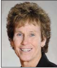
20th Season Overall; 7th/15th at San Diego State (Ohio Wesleyan, 1979)