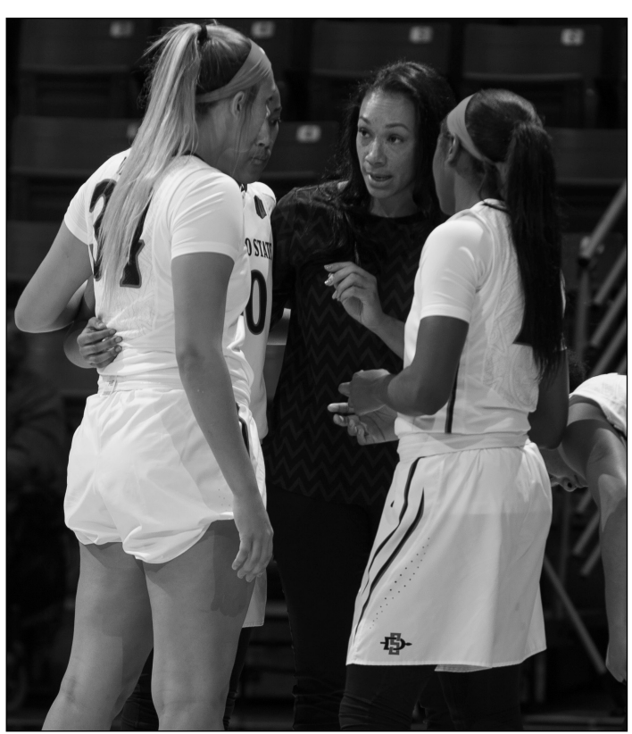
► 2017-18 SAN DIEGO STATE WOMEN'S BASKETBALL