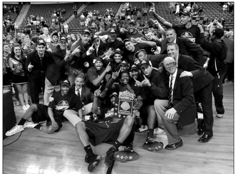
San Diego State went through Colorado State and No. 8/8 New Mexico in the quarterfinals and semifinals, respectively, at the MWC tournament and capped its run by beating UNLV in the championship game on the Runnin' Rebels home court.

season with a 25-9 record, marking the first time in school history that an Aztec team has recorded five straight 20-win seasons. SDSU basketball dates back to the 1921-22 campaign.