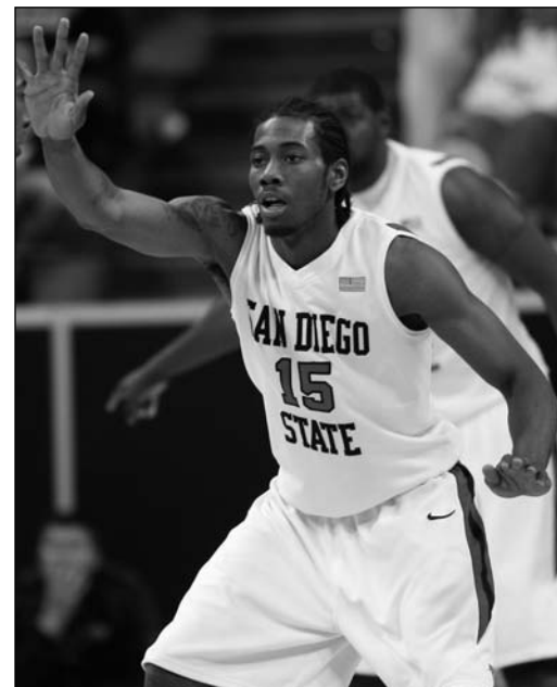
Kawhi Leonard was named the most valuable player of the Mountain West tournament.

marked the first time in SDSU's Division I history that an Aztec team posted five consecutive winning conference efforts.