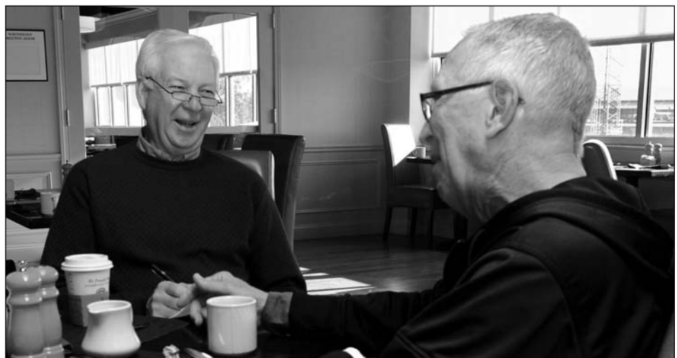
CBS college basketball analyst Bill Raftery (left) met with San Diego State head coach Steve Fisher (right) at the team's hotel to discuss the Aztecs' first-round match-up with the sixth-seeded Volunteers.