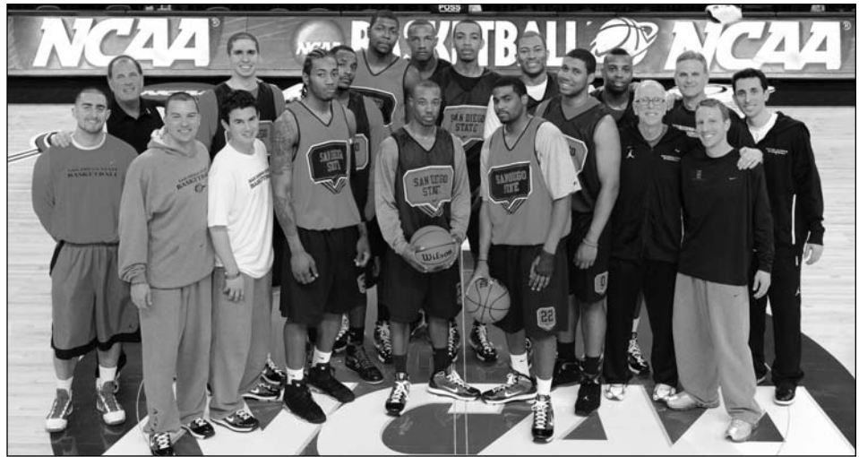
San Diego State participated in an hour-long open-to-the-public practice at Dunkin' Donuts Center the day prior to its first-round NCAA Tournament game vs. Tennessee.