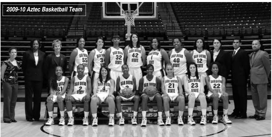
2009-10 Aztec Basketball Team