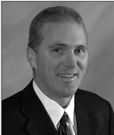
► The Chuck Long File