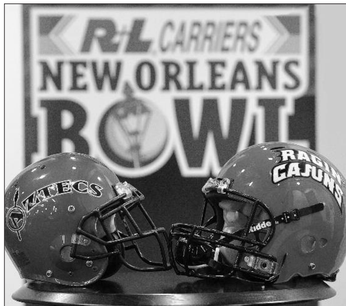
The 2011 R+L Carriers New Orleans Bowl was the first all-time meeting between San Diego State and Louisiana-Lafayette.